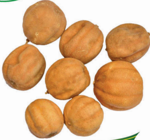
ليمون اصفر Yellow Lemon