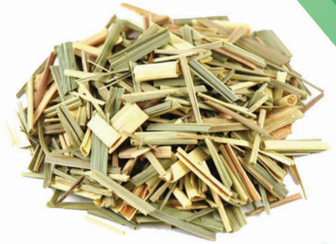
حشيشة ليمون Lemongrass