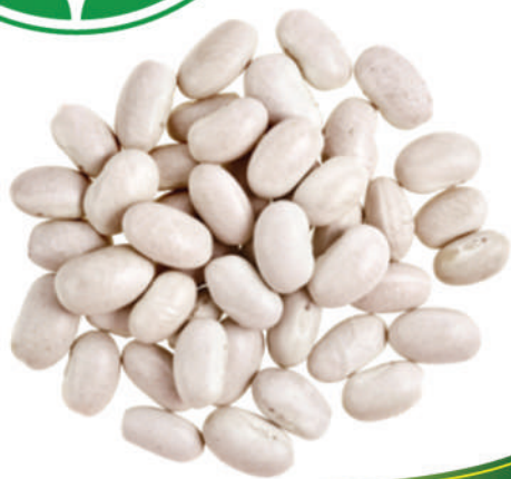
فاصوليا White Bean