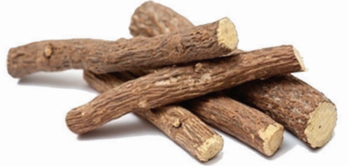
عرق سوس Licorice