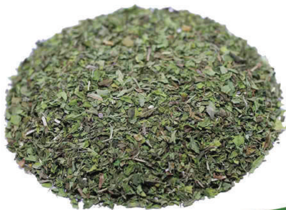
نعناع فلفلی Peppermint