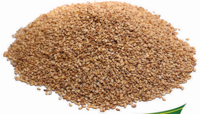
سمسم ذهبي Golden Sesame