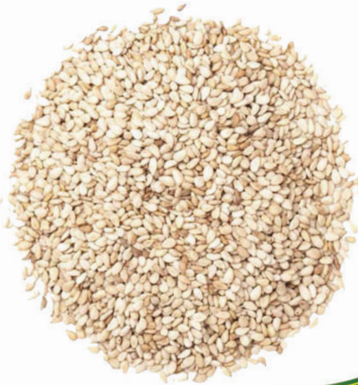
سمسم ابيض White Sesame