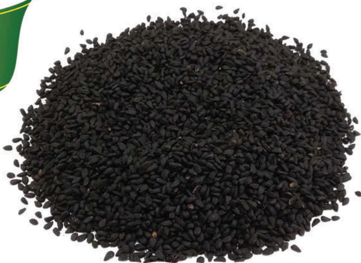
حبة البركة Nigella Sativa