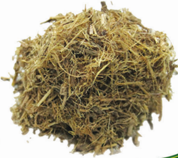
عرق سوس Licorice