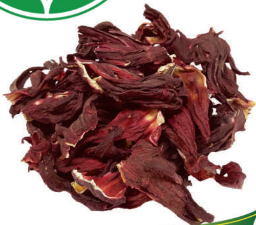
کرکدیه زهر Hibisucs Flowers