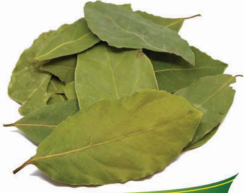
ورق الفار Bay Leaves