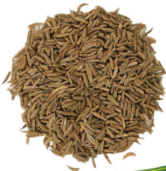
كراوية Caraway Seeds