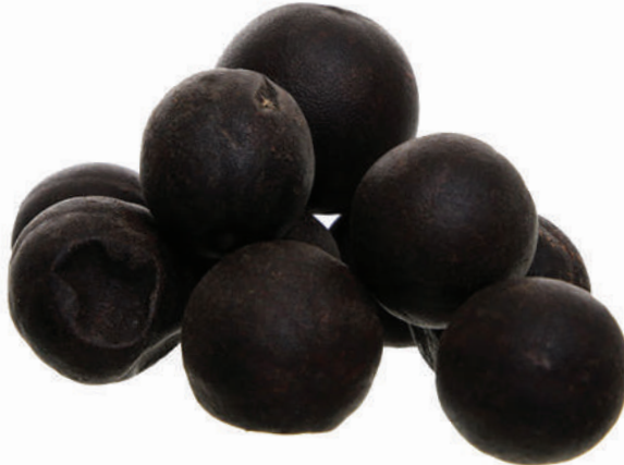
ليمون اسود Black lemon