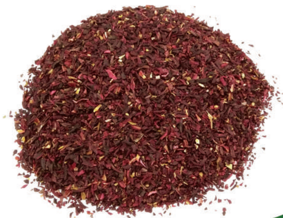
کرکدیه تی بی سی Hibisucs TBC