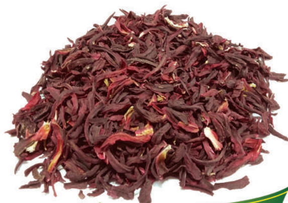
کرکدیه شرائح Hibisucs Slices