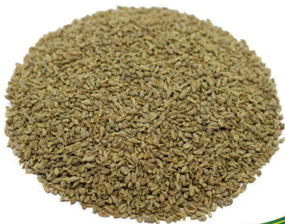
يانسون Anise seeds