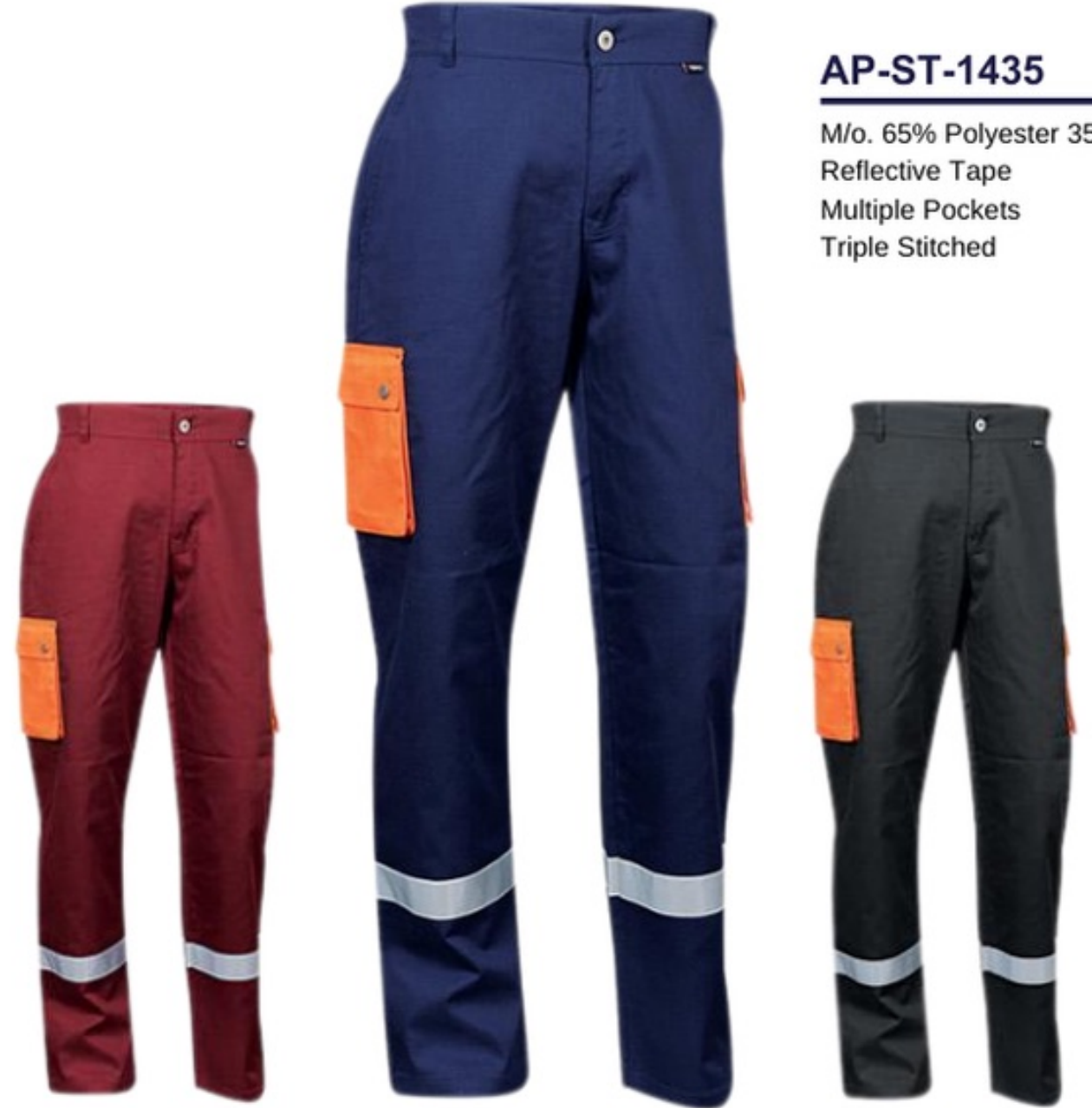
AP-ST-1435 M/o. 65% Polyester 35% Cotton Reflective Tape Multiple Pockets Triple Stitched