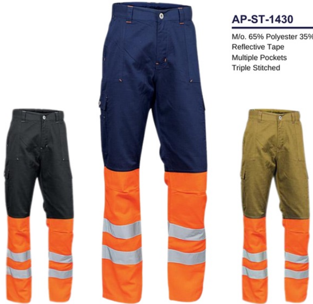
AP-ST-1430 M/o. 65% Polyester 35% Cotton Reflective Tape Multiple Pockets Triple Stitched