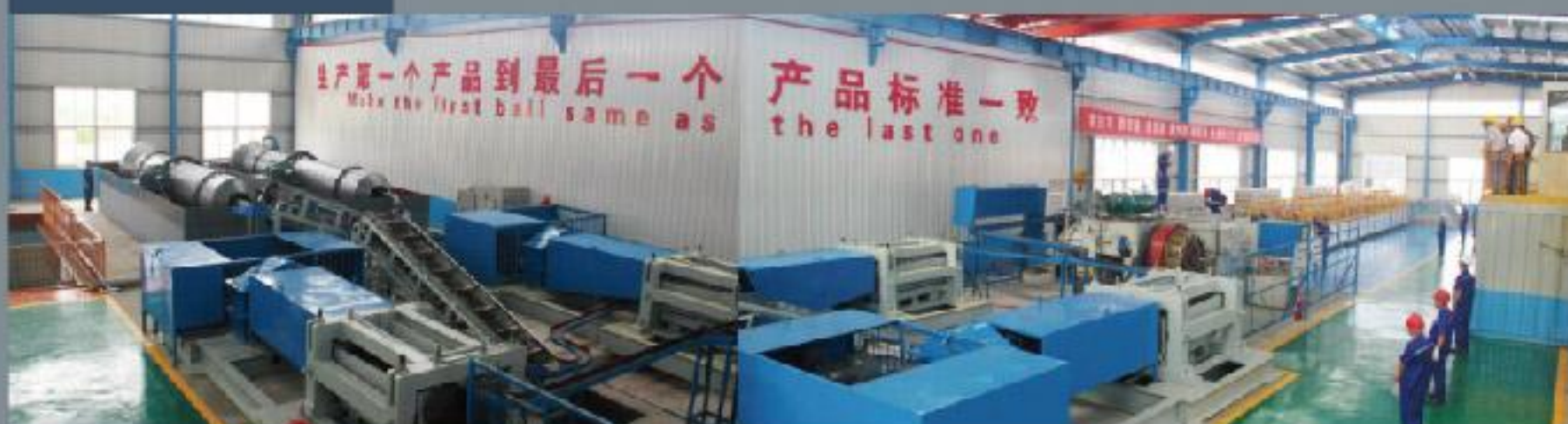
SAG mill steel ball automatic equipment