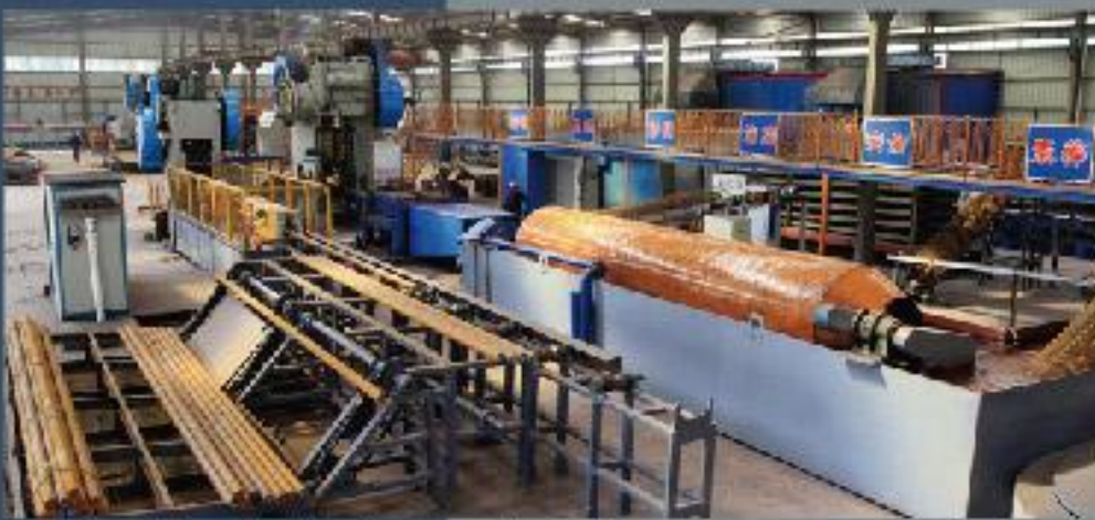
Automatic production line for rolling ball