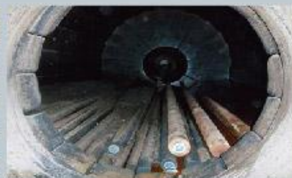
Loading of grinding rods