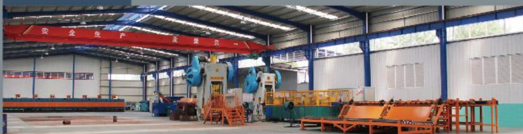
Intelligent rolling forged steel ball complete equipment