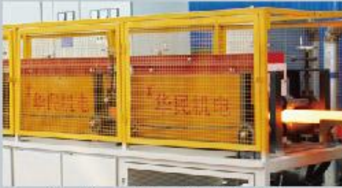
Continuous Electrical Heating