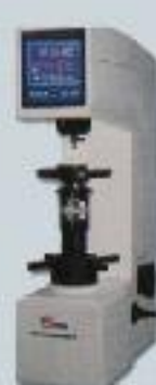
Hardness testing equipment