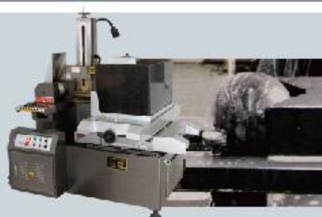
Wire Cutting Machine