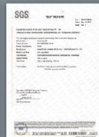
SGS Test Report