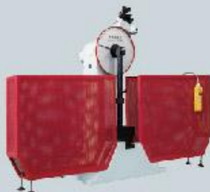
Impact value testing machine