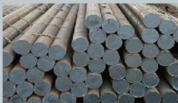
Steel grinding rod