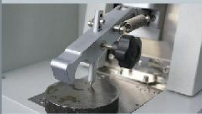
The inner quality of sampling test