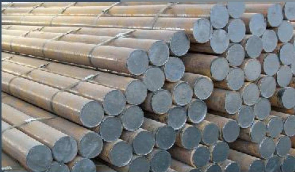
New materials of HM series special forging steel ball