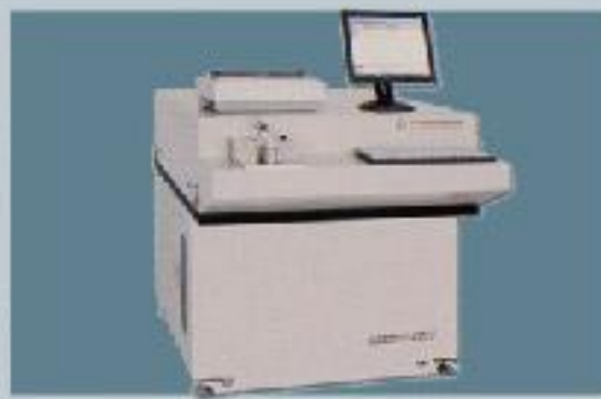
Chemical elements analysis