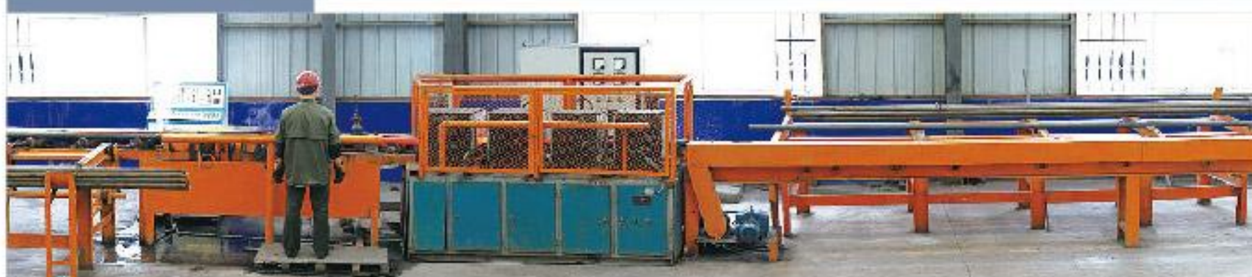
Steel grinding rod patented automated production equipment Equipment Patent Number: 200810238243.3