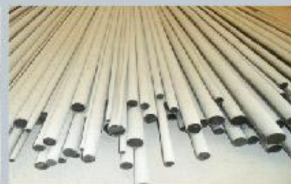
Unloading view after using in rod mill

One of the largest producer and exporter for steel grinding rods in China.