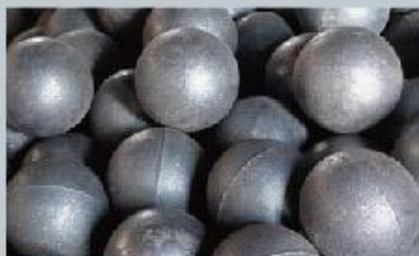
Grinding Steel Ball