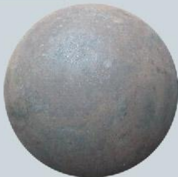
\Phi 120- \Phi 200mm large diameter forged balls for SAG mill Application

We can provide customers forged steel balls with different materials, high hardness and ranging from \Phi 20mm to \Phi 200mm.