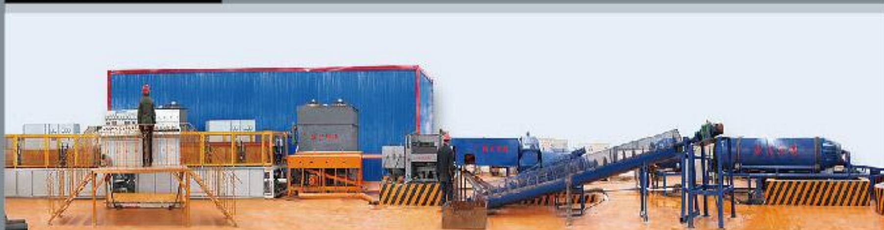
Rotary rolling grinding ball automatic production line, originated by Huamin. Equipment Patent Number: ZL200610043960.1