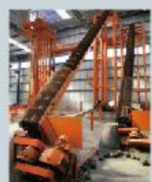
Dropping test machine