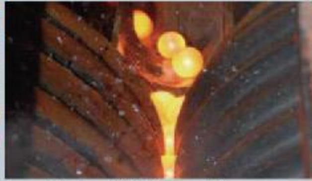
Rotary Roll Forged Process