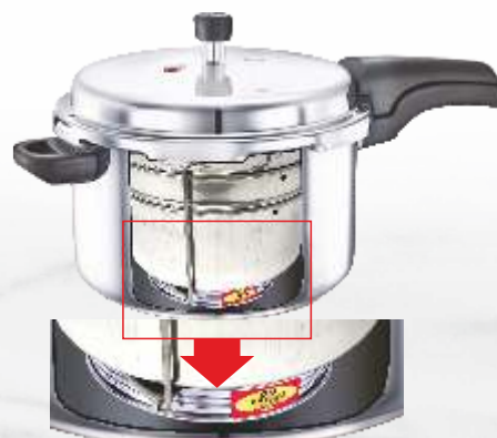
Hot Pot Ring inside Pressure Cooker