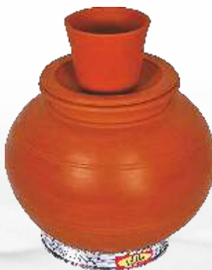
Hot Pot Ring for holding Matka