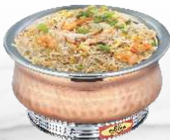
Hot Pot Ring for holding Handi/utensils