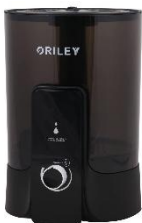
External Humidifier System