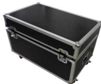
Carrying case (optional)