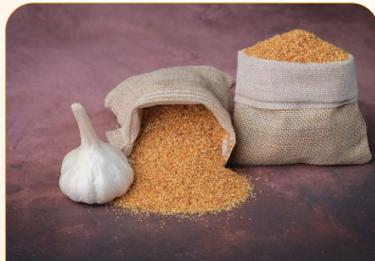
Garlic Granules (0.5-1mm)