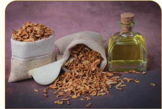
Fried Coated White Onion