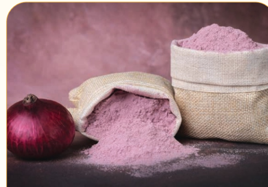
Red Onion Powder