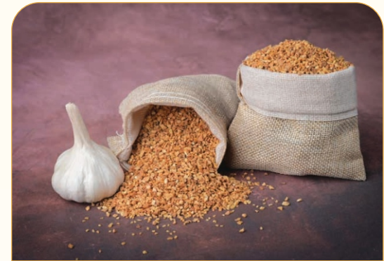
Garlic Minced (1-3mm)