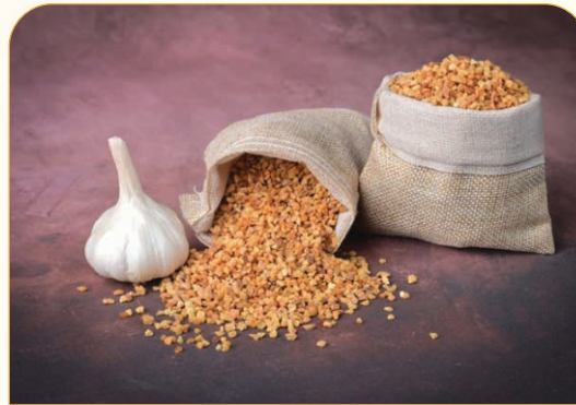
Garlic Chopped (3-5mm)