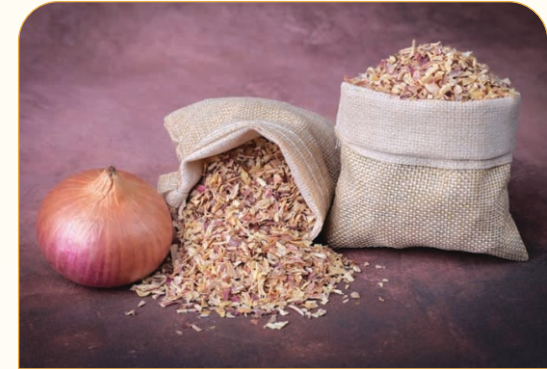
Pink Onion Minced (1-3mm)