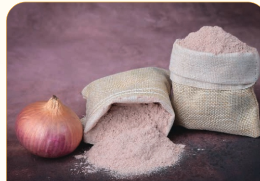
Pink Onion Powder