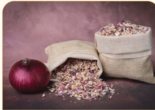
Red Onion Chopped (3-5mm)