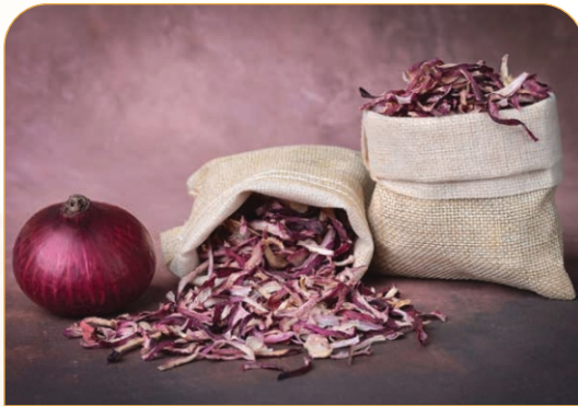
Red Onion Flakes