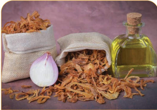
Fresh Fried Onion