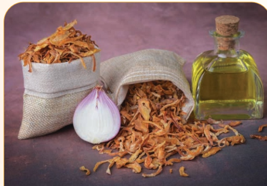
Fried Pink Onion Flakes