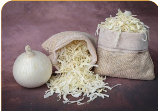
White Onion Flakes