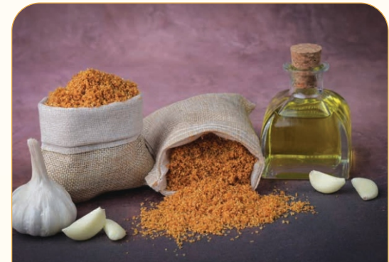
Fried Garlic Granules (0.5-1mm)