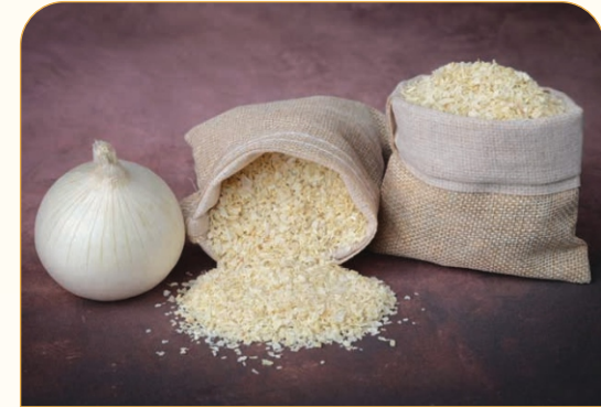
White Onion Minced (1-3mm)