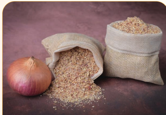
Pink Onion Granules (0.5-1mm)