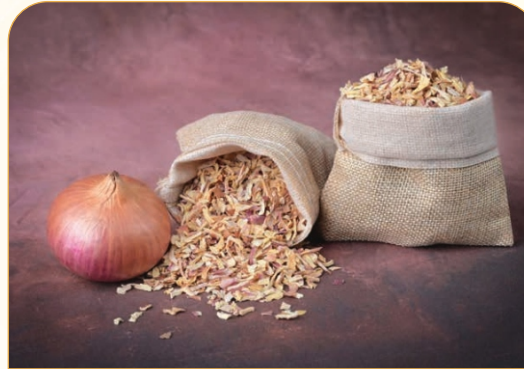
Pink Onion Chopped (3-5mm)