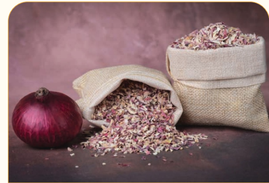
Red Onion Minced (1-3mm)