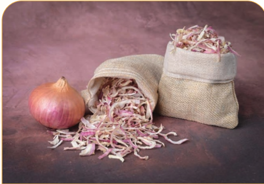
Pink Onion Flakes