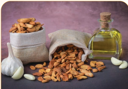
Fried Garlic Cloves