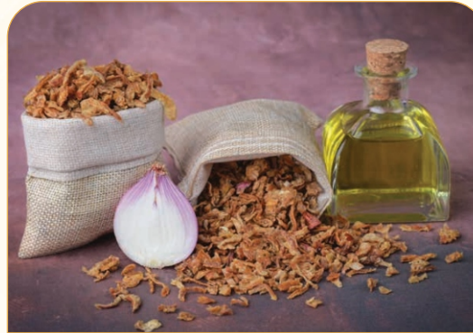
Fried Coated Pink Onion