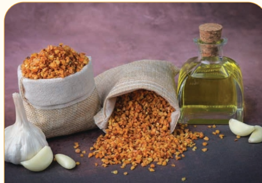
Fried Garlic Minced (1-3mm)