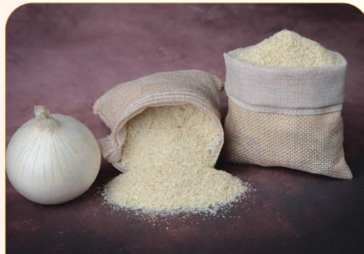
White Onion Granules (0.5-1mm)