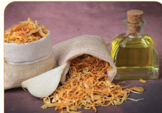
Fried White Onion Flakes