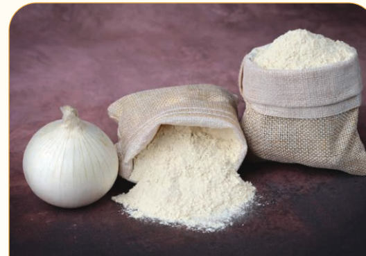
White Onion Powder