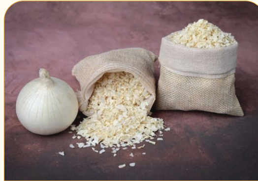
White Onion Chopped (3-5mm)