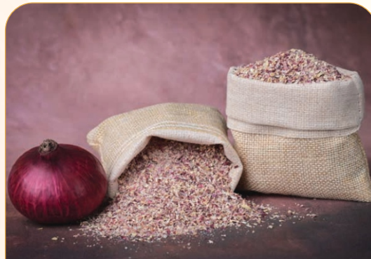
Red Onion Granules (0.5-1mm)