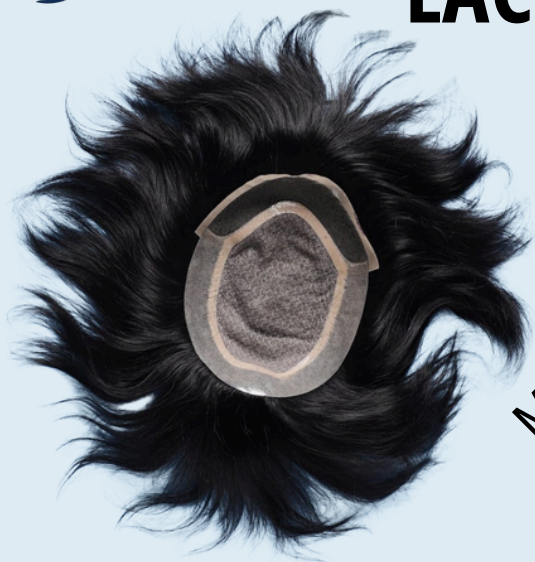
MIRAGE FRONT LACE