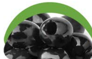
WHOLE OXIDIZED OLIVES