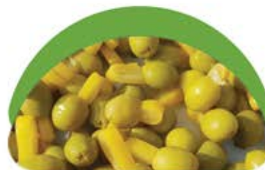
OLIVES STUFFED LEMON