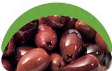
PITTED NATURAL BLACK OLIVES