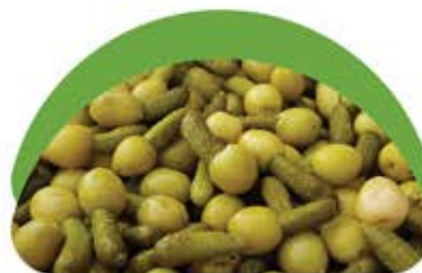
OLIVES STUFFED CUCUMBERS