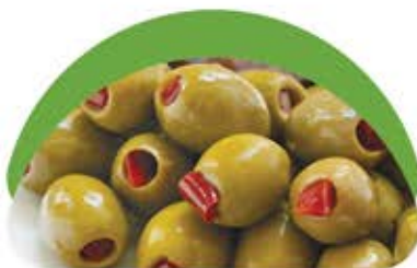
OLIVES STUFFED PEPPERS