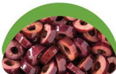
SLICED NATURAL BLACK OLIVES