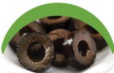
SLICED OXIDIZED OLIVES