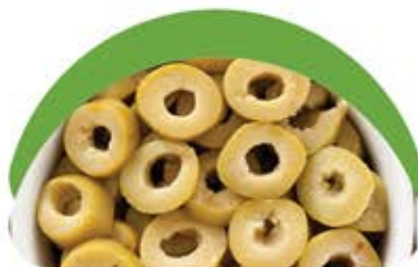
Sliced Green Olives