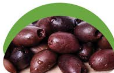
PITTED KALAMATA OLIVES