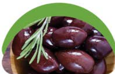
WHOLE KALAMATA OLIVES