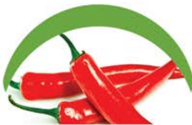
Red Banana Peppers