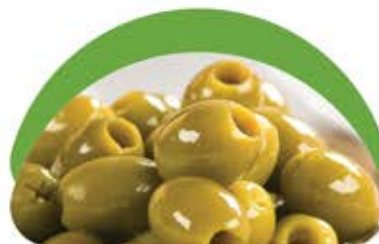
Pitted Green Olives