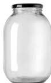
Glass Jars 370ml/720ml/480ml