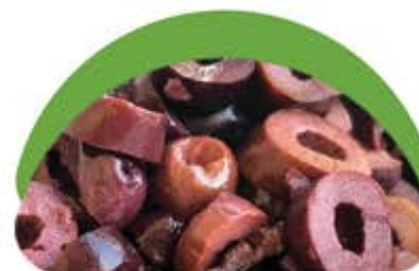
SLICED KALAMATA OLIVES