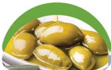
Whole Green Olives

Available packing : Glass jars - Tins - PET - Pouches - Sterilized Product - Pasterurized Product .