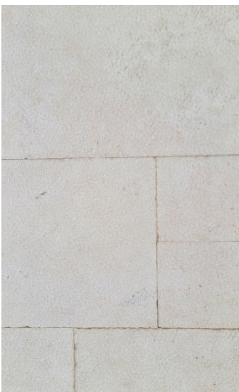
Bush Hammered + Brushed