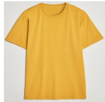
Round Rib Neck T-Shirt

We can customize the fabric in any blend and produce different style of garment as per our buyers requirement