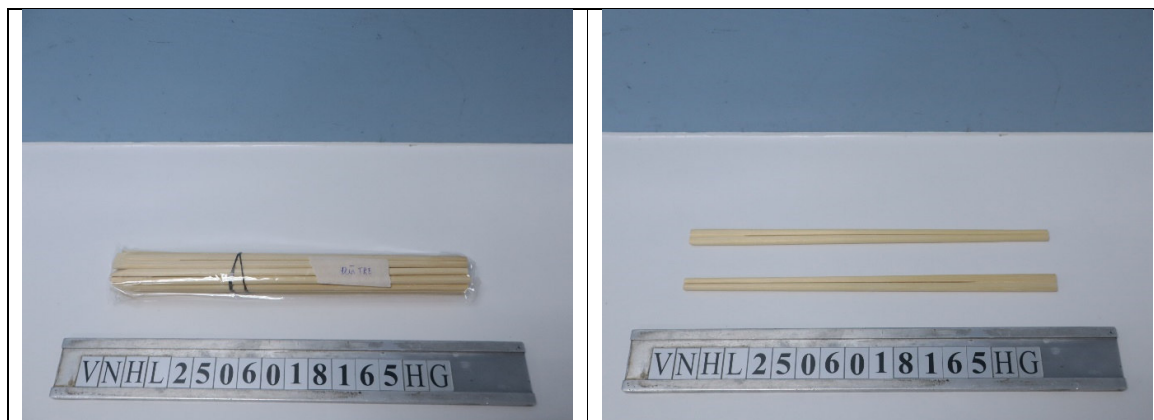
PHOTO OF SUBMITTED SAMPLE FOR TESTING

REPORT RESULTS REFER TO SUBMITTED SAMPLE(S) ONLY