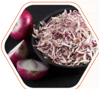
Red Onion Flakes