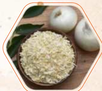
White Onion Chopped