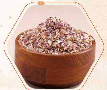
Red Onion Chopped