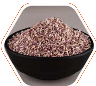
Red Onion Minced