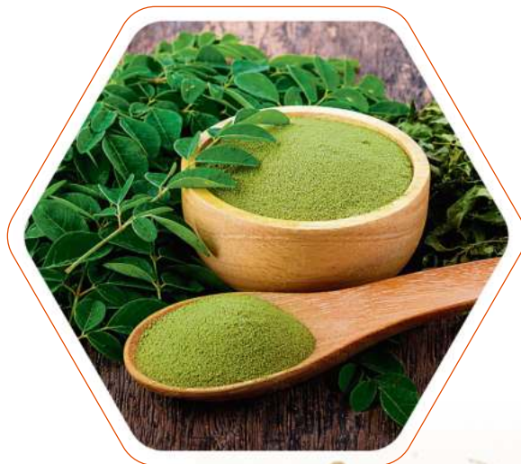
Moringa Leaves Powder