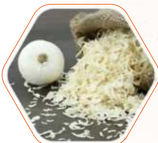
White Onion Flakes