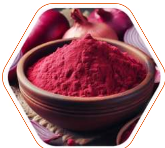
Red Onion Powder

Red onions are typically found in several Indian states, including Madhya Pradesh, Maharashtra, and Gujarat. Red onions are sweeter and milder. Antioxidants are more abundant in red onions than in other varieties. We buy red onions from the districts of Nashik in Maharashtra and Mahuva in Gujarat. after going through a number of quality checks. White onions are processed into kibble, flakes, minced (3 mm), chopped (5-3 mm), granules (0.5-1 mm), and even powder.