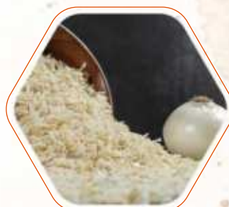
White Onion Granules