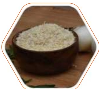
White Onion Minced