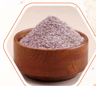
Red Onion Granules