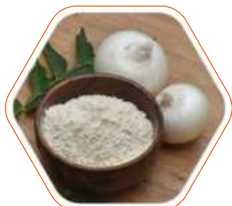
White Onion Powder

White onions are typically found in Gujarat, India's lower cost, where the Gujarati district of Bhavnagar has the highest crop. The country from which the majority of fresh and even dehydrated white onions are exported. Compared to red onions, white onions have more "antibiotic and anti-inflammatory" properties. We buy white onions directly from the farmers as well as from APMC of Mahuva. after going through a number of quality checks. White onions are processed into kibbled, flake, chopped, 1-3 mm, minced, 0.5-1 mm, and even powdered forms.