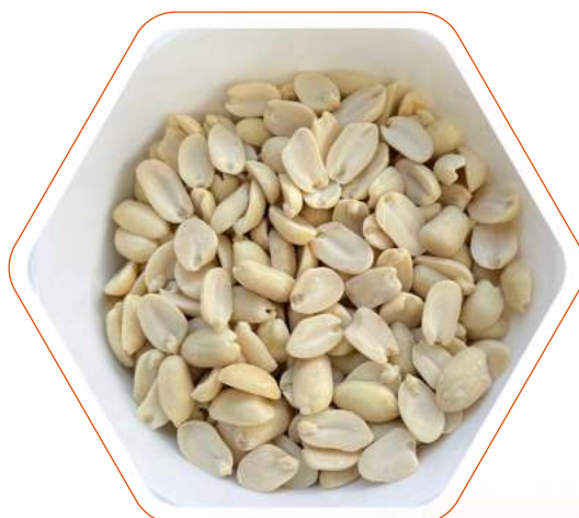
Split Blanched Peanuts White