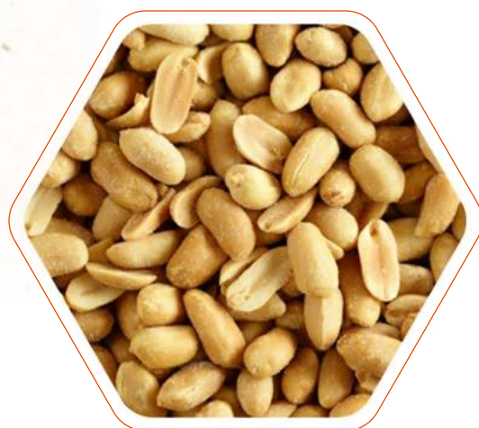
Split Blanched Peanuts Brown