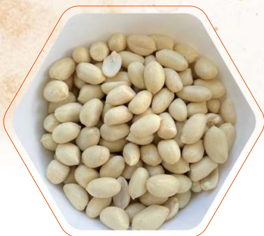
Whole Blanched Peanuts