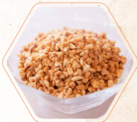
Peanuts Dices Brown