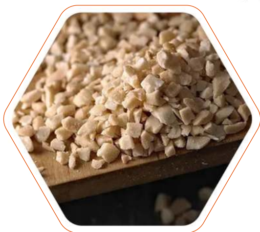
Peanuts Dices White