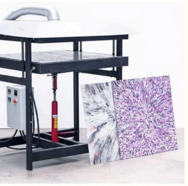
150 * 150 Cm sheet press manual