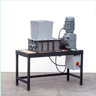
Shredder v - 4