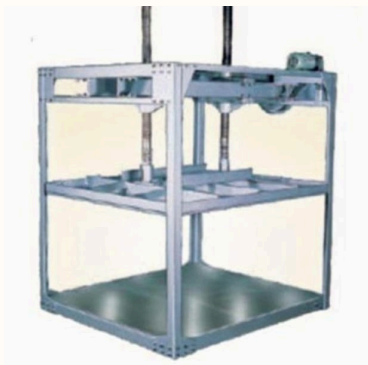
Cold Press Manual