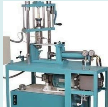
Injection Moulding Machine