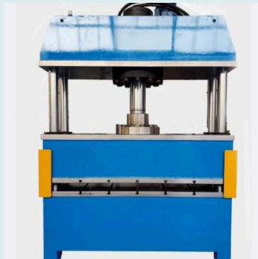
4 Pillar Hydraulic Press