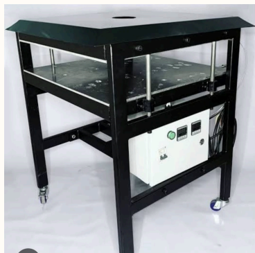
60 * 60 Sheet Press Manual