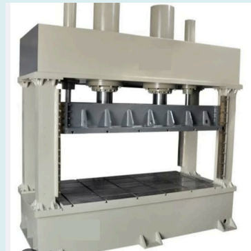
Fixed Frame Hydraulic Press