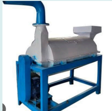
Plastic Drayer Machine