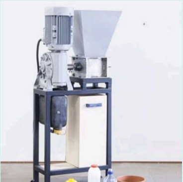
Shredder v - 3