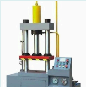
2 Pillar Hydraulic Press