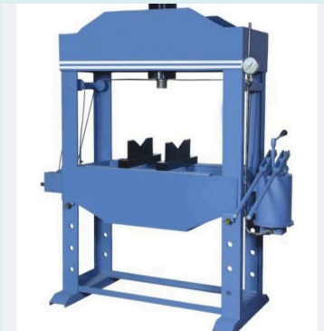
H - Type Hydraulic Press