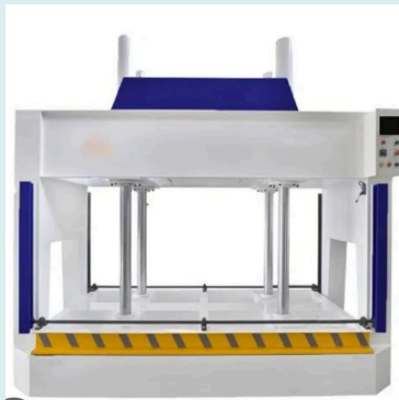
Laminate Hydraulic Press