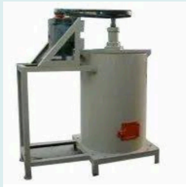
Plastic Washing Machine