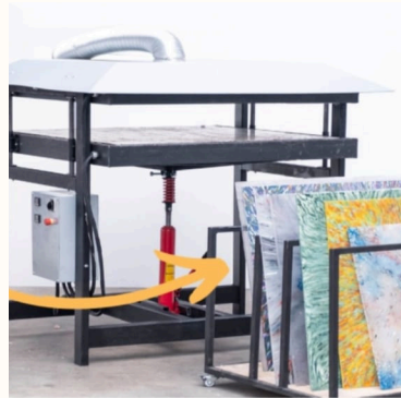
100 MM sheet press automatic