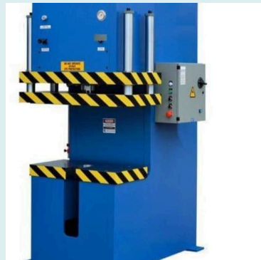
C - Type Hydraulic Press