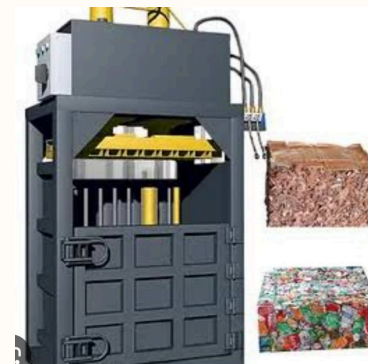
Bailing Press Plastic Verticle