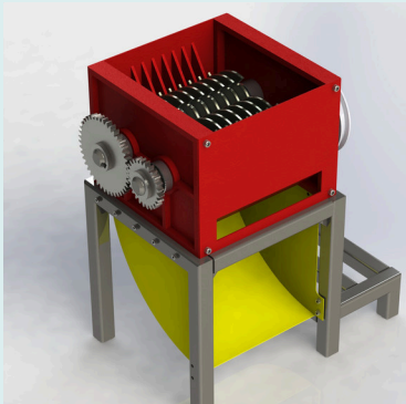
Shredder v - 2