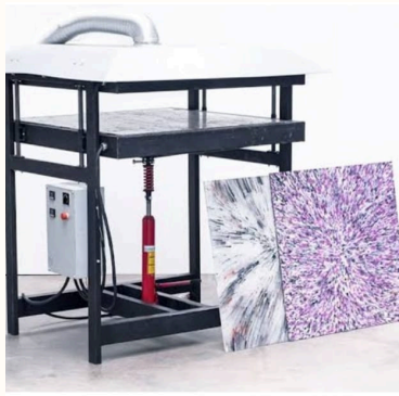
100 MM sheet press manual