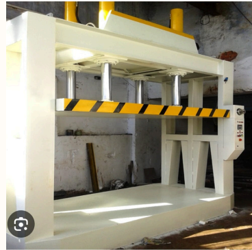
120 * 240 Cm sheet press