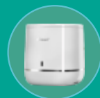
Food Waste Composter