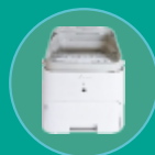
Auto cat litter box

Foshan Shunde Augewei Electric Appliances Co.,Ltd. Add: No.21Sanle Road (E),Beijiao Industrial Zone,Shunde Foshan city ,GD.528311 P .R.China