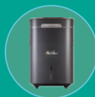
Food Waste Composter