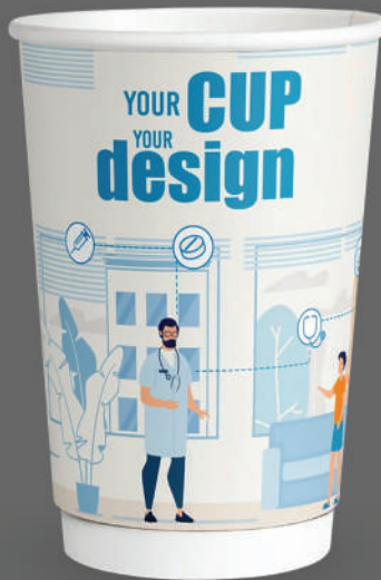
Customized Double Wall Paper Cup