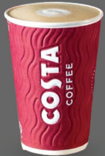
Customized Ripple Wall Paper Cup