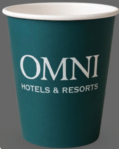
Customized Single Wall Paper Cup