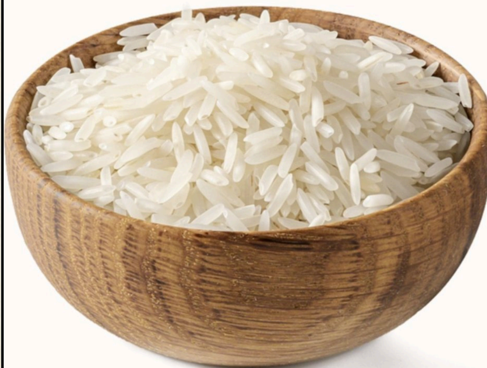
Sugandha Steam Sella Basmati Rice