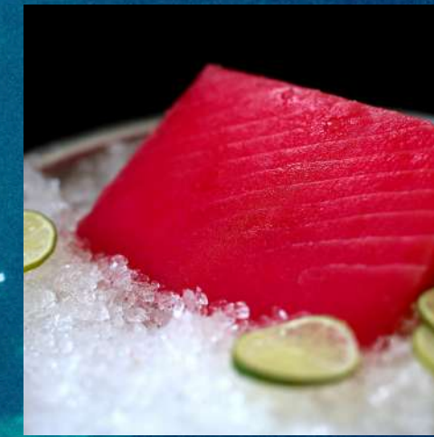
TUNA SAKU BLOCK