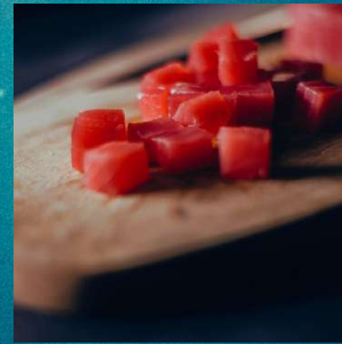
TUNA CUBE (HAND CUT)