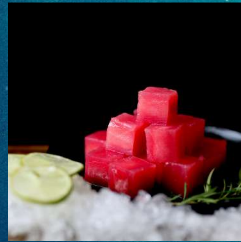
TUNA CUBE (SAW CUT)