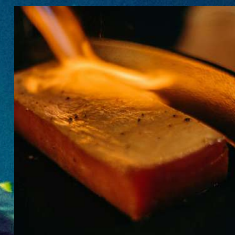
TATAKI BLOCK TUNA MARINATED