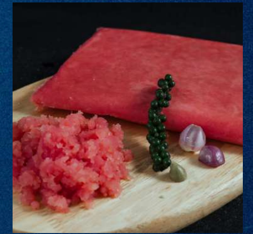
TUNA GROUND MEAT