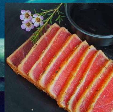
SEARED TUNA SLICES