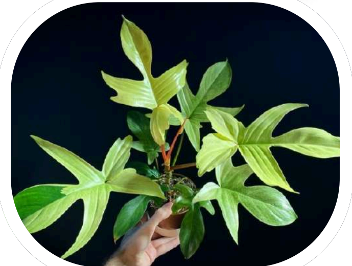
Craft and Plants