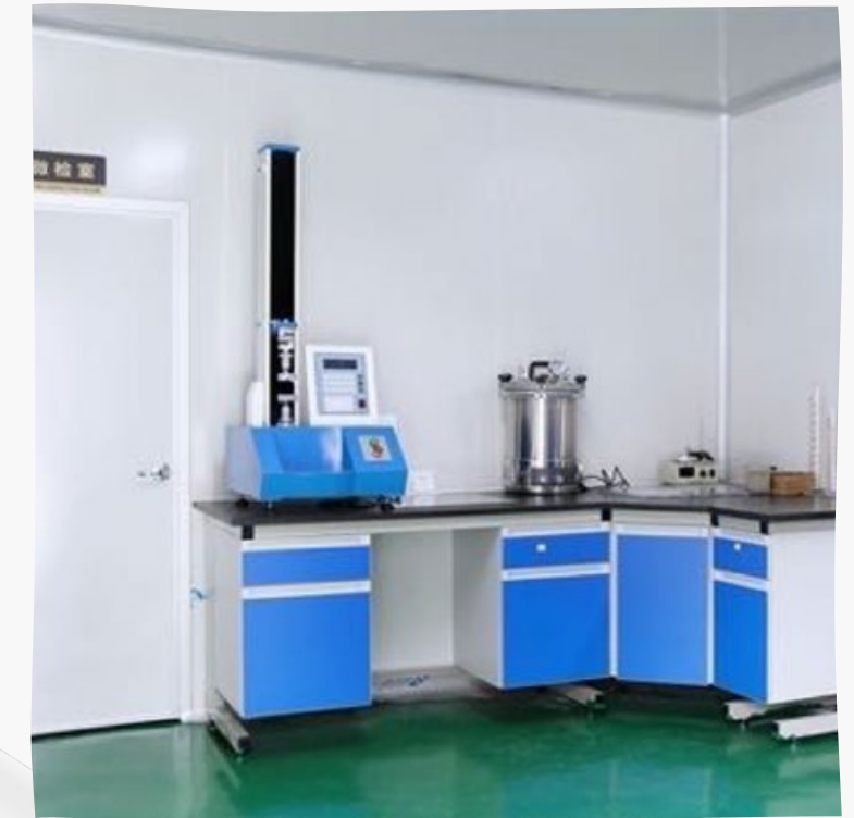
Microbiological testing room