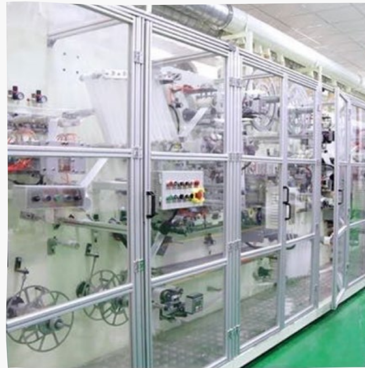
A fully enclosed and dust-free assembly line