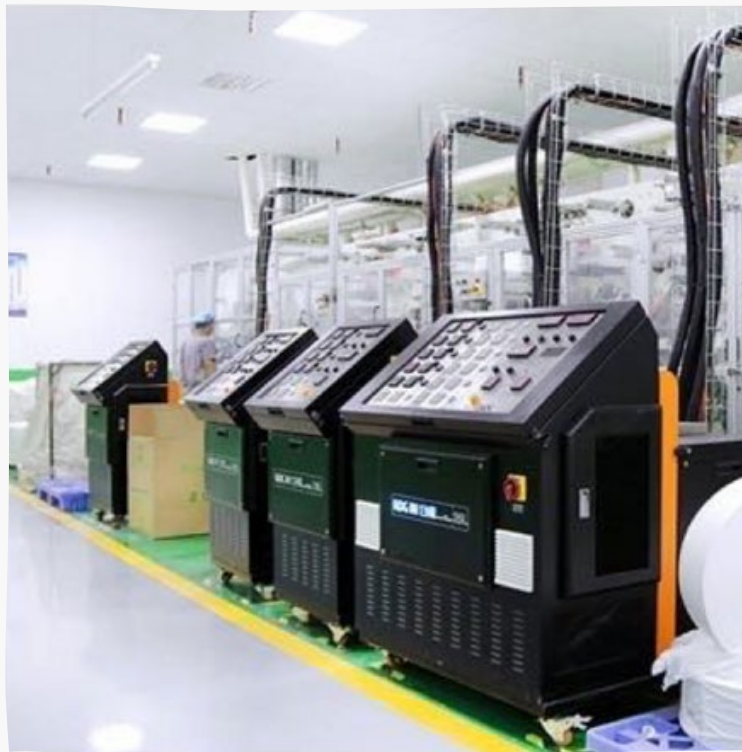
The workshop is designed as an integrated space

The factory adopts imported fully automated assembly lines, ensuring safety, efficiency, and hygiene with a sterile environment