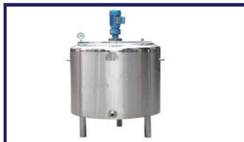
TANK WITH AGITATOR