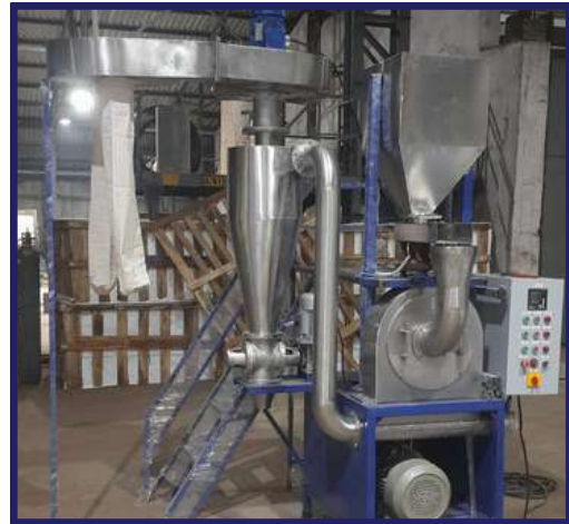
COCONUT FLOUR GRINDING MACHINE