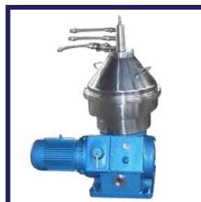
CENTRIFUGE FOR VIRGIN COCONUT OIL