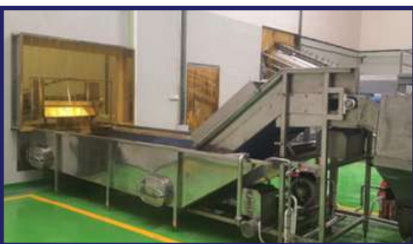
COCONUT BUBBLE WASHER