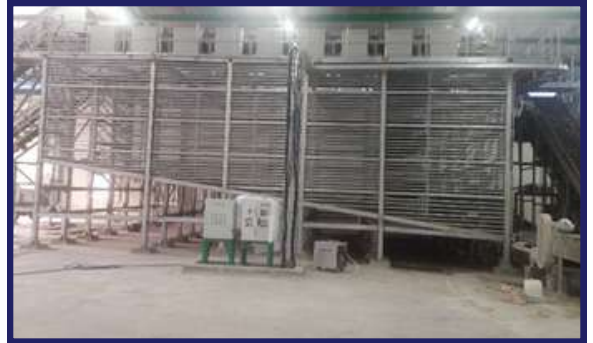
NUTS STORAGE BIN