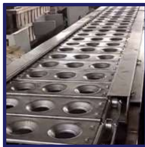
COCONUT WATER EXTRACTION CONVEYOR