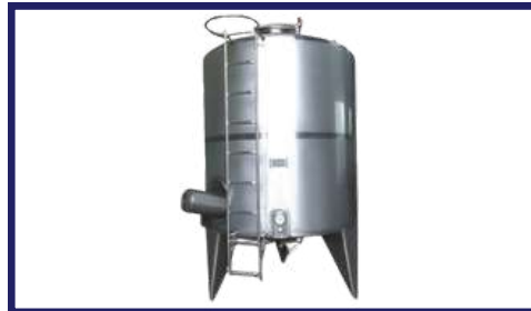
VERTICAL STORAGE TANKS