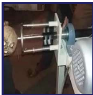
COCONUT WATER DRILLING MACHINE