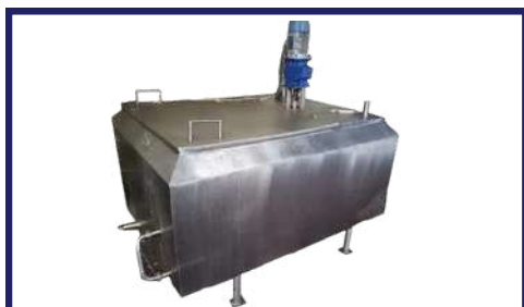
HORIZONTAL MILK STORAGE TANK