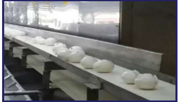
KERNEL CARRYING CONVEYOR