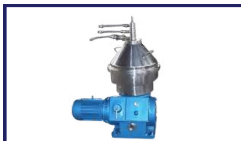
CENTRIFUGE FOR CREAM