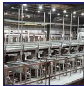
COCONUT DRILLING UNIT