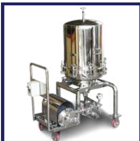
SPARKLER FILTER (POLISH FILTER)