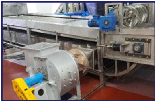
MESH BELT COOLER