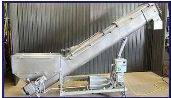
SCREW CONVEYOR WITH WASHING ARRANGEMENT