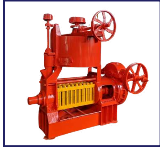
PARING OIL EXPELLER