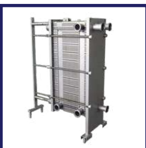
CHILLING PHE FOR COCONUT WATER