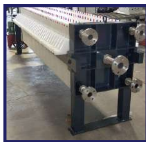
FILTER PRESS WITH FOOD GRADE PP PLATES