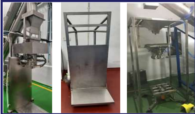
AUTOMATIC BATCH WEIGHER