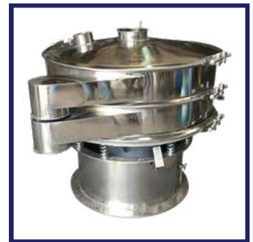
VIBROSCREEN GRADING MACHINE