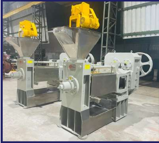
VCO OIL EXPELLER HIGH CAPACITY