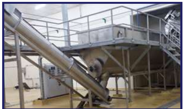
STORAGE TANK (MEAT TANK)