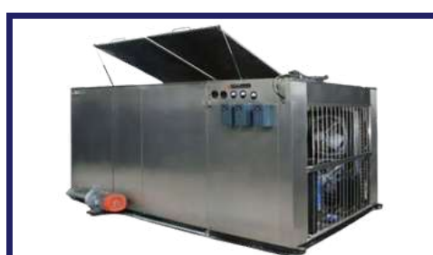
ICE BANK TANK (IBT)