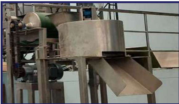
COCONUT KERNEL SLICER