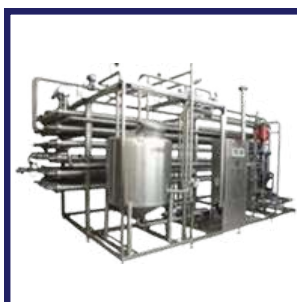
ASEPTIC WATER PLANT