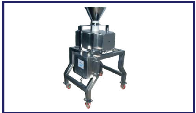
GRAVITY FEED METAL DETECTION SYSTEM FOR DRY POWDER