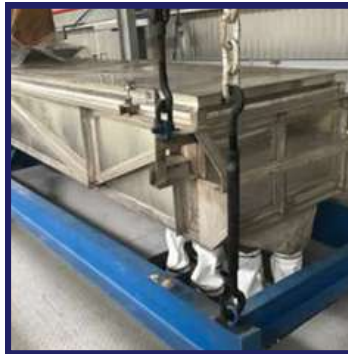
NOVATEX (HIGH CAPACITY) SORTING MACHINE