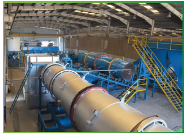
Our state-of-the-art NPK Fertilizer manufacturing unit at UAE