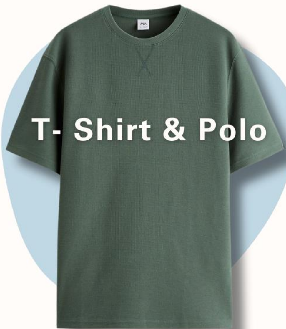
T- Shirt & Polo