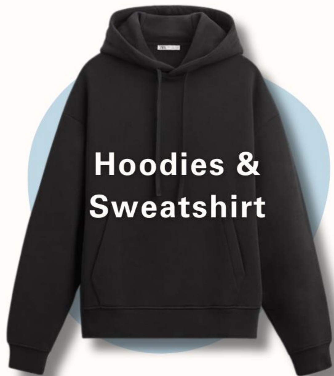
Hoodies & Sweatshirt