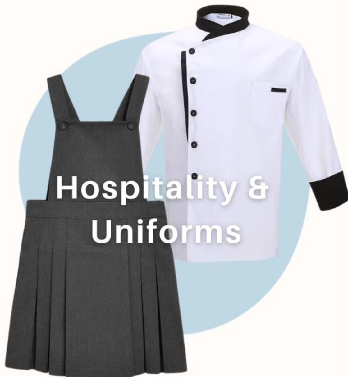
Hospitality & Uniforms