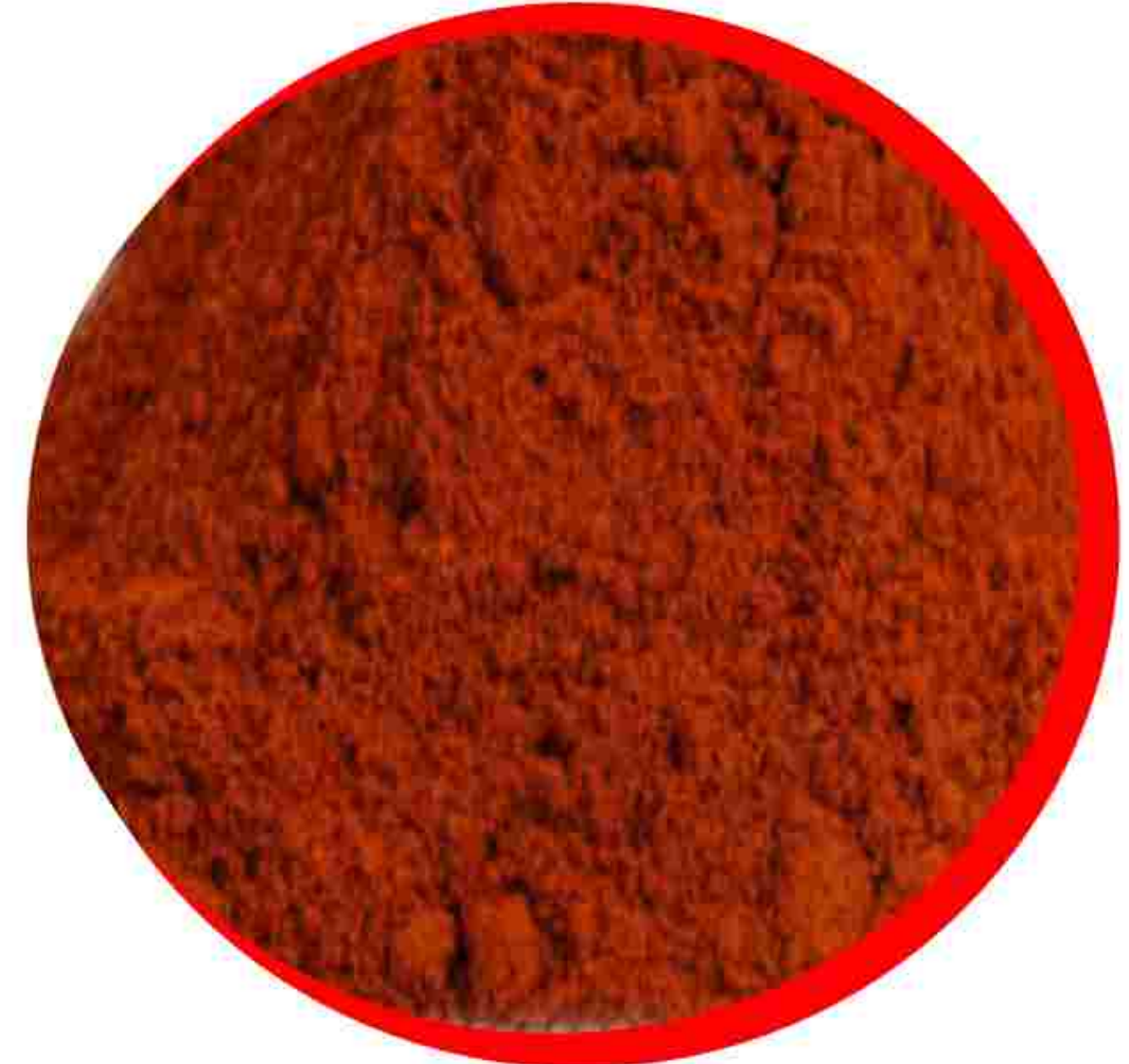
Spices and Herbs