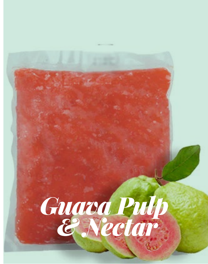
Guava Pulp & Nectar