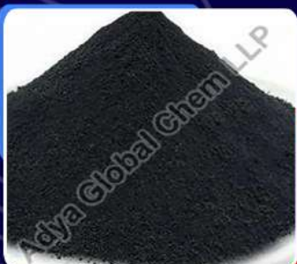
Roasted Molybdenum Concentrate Powder