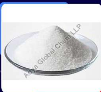
Colloidal Silicon Dioxide Powder