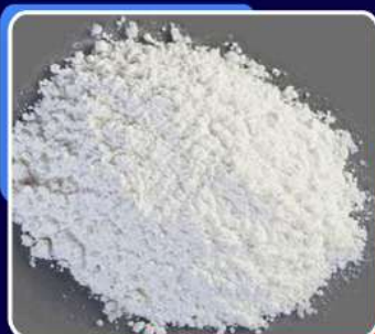
Sodium Citrate Tribasic Powder