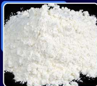
Potassium Acetate Powder