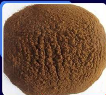
Sodium Lignosulfonate Technical Powder