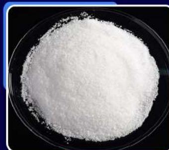
Sodium Phosphate Dibasic Powder