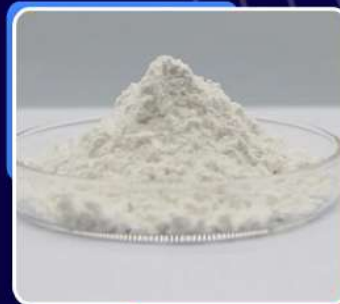
Sodium Acid Pyrophosphate Powder