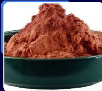
Ferrous Fumarate Powder