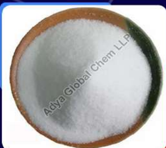
Ammonium Tetra Molybdate Powder