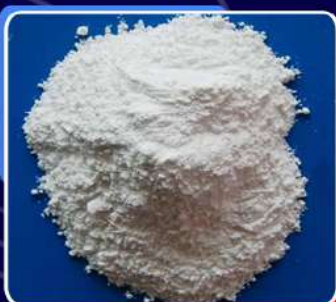
Dibasic Calcium Phosphate