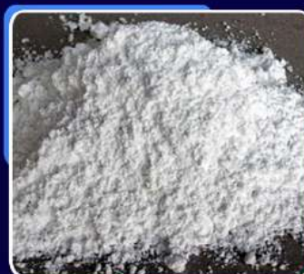
Hydrated Lime Powder