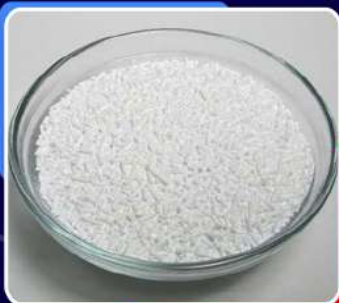
Sodium Benzoate Powder