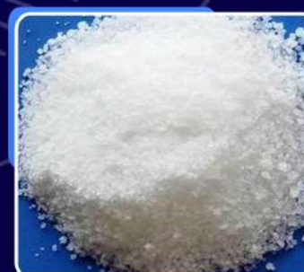
Sodium Phosphate Monobasic