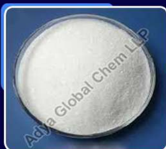
Sodium Molybdate Powder