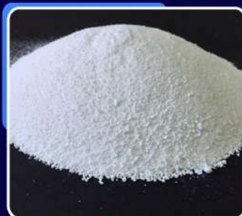
Sodium Phosphate Dibasic 12 Hydrate