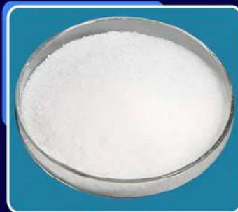
Sodium Chloride Powder