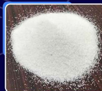
Potassium Chloride Powder