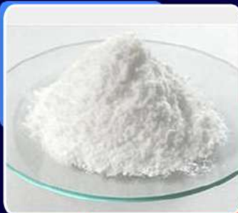
Calcium Citrate Malate Powder