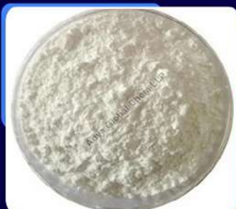
Ammonium Dimolybdate Powder