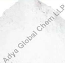
Calcium Chloride Dihydrate Powder