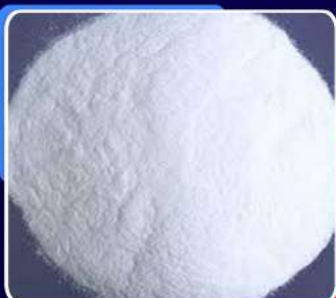
Sodium Lauryl Sulphate Powder