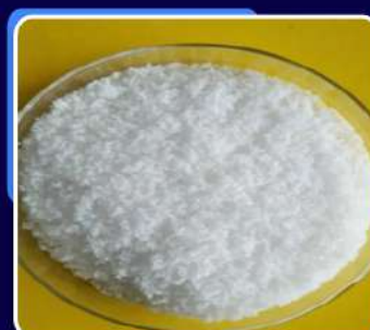
Zinc Sulphate 7 Hydrate Powder