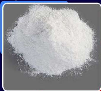
Calcium Propionate Powder