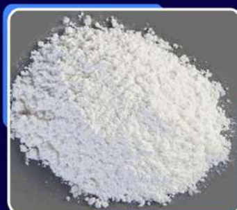
Potassium Phosphate Diabasic Powder