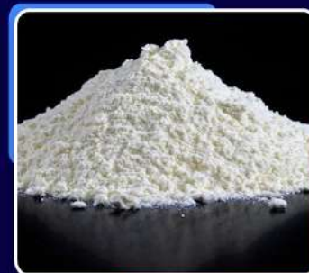
Potassium Bicarbo- nate Powder