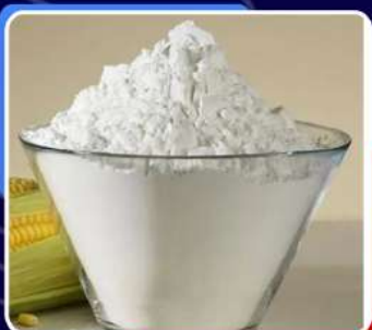
Maize Starch Powder