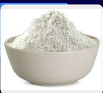
Kaolin Clay Powder