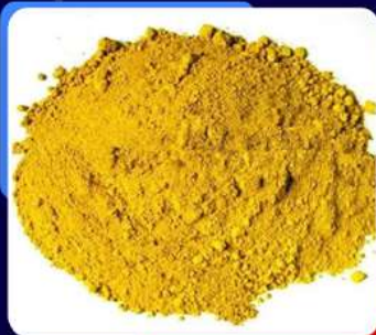
Bismuth Oxide Powder