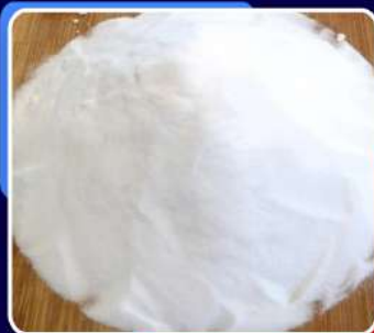
Sodium Bicarbonate Powder