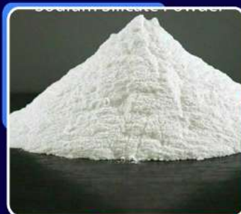
Sodium Silicate Powder