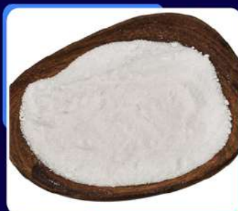
Potassium Iodide Powder