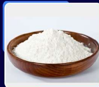
Zinc Stearate Powder