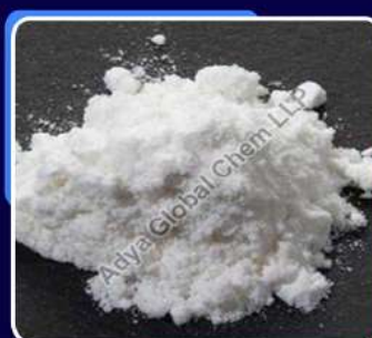
Magnesium Chloride Hexahydrate Powder