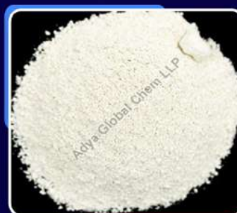
Sodium Starch Glycolate Powder