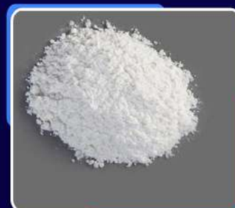
Potassium Phosphate Monobasic Powder