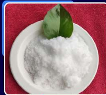
Sodium Citrate Dibasic Powder