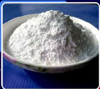
Ferric Orthophos- phate Powder