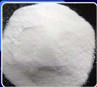
Dicalcium Phosphate Powder