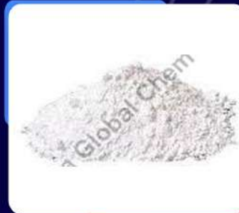
Microcrystalline Cellulose Powder