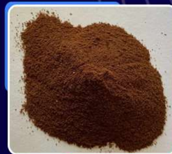
Ferric Ammonium Cit- rate Powder