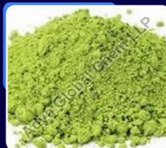
Molybdenum Trioxide Powder