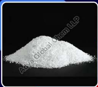
Magnesium Stearate Powder