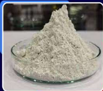
Ferric Pyrophosphate Powder