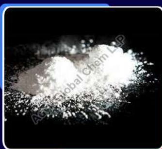
Crospovidone USP Powder