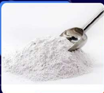
Sodium Citrate Monobasic Powder