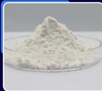
Sodium Acetate Trihydrate