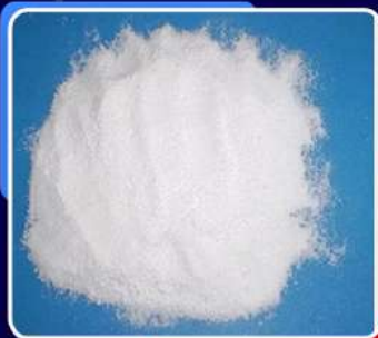
Sodium Acetate Anhydrous