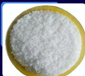
Zinc Sulphate 1 Hydrate Powder