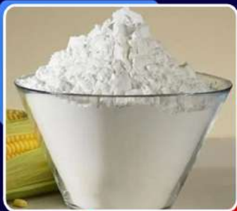
Maize Starch Powder