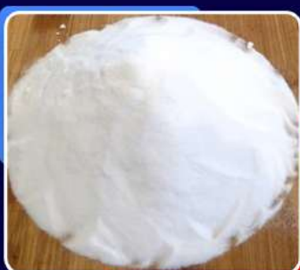
Sodium Bicarbonate Powder