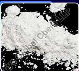
Dicalcium Phosphate Dihydrate Powder