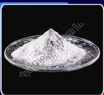
Croscarmellose Sodium Powder