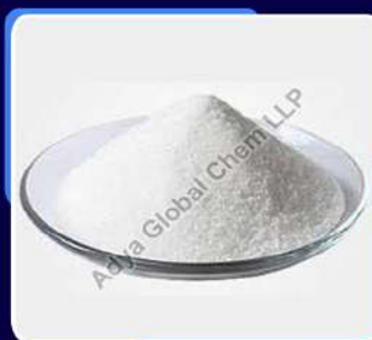
Dextrose Anhydrous Powder