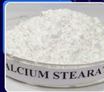
Calcium Stearates Powder