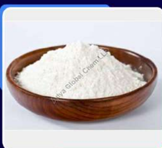
Lactose Monohydrate Powder