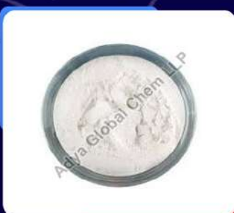
Hypromellose Phthalate Powder