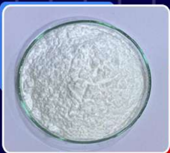
Calcium D Saccharate, Powder