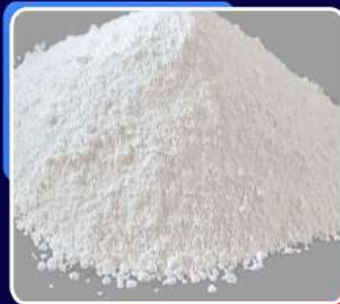
Calcined Clay Powder