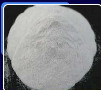
Sodium Phosphate Tribasic 12 Hydrate Powder