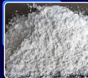
Hydrated Lime Powder