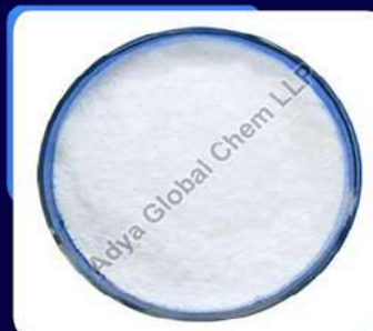
Ammonium Hepta Molybdate Powder