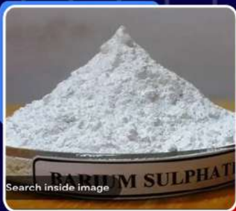
Barium Sulphate Powder