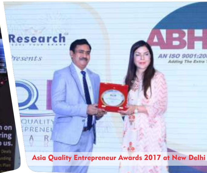
Asia Quality Entrepreneur Awards 2017 at New Delhi