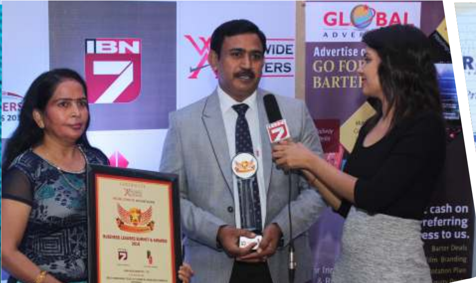
Bussiness Leadership Award 2016 at Mumbai