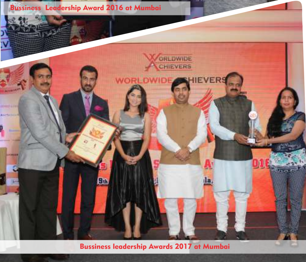
Bussiness leadership Awards 2017 at Mumbai