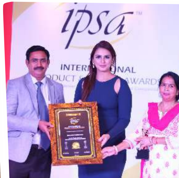
Quality Textile Chemicals Manufacture of the Year (Delhi-NCR) 15 OCT 2016