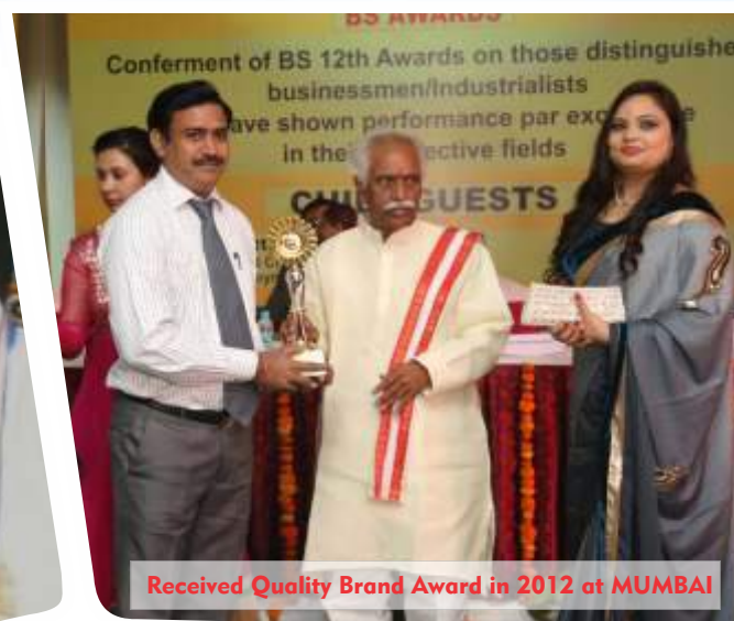
Received Quality Brand Award in 2012 at MUMBAI