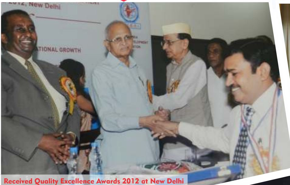
Received Quality Excellence Awards 2012 at New Delhi