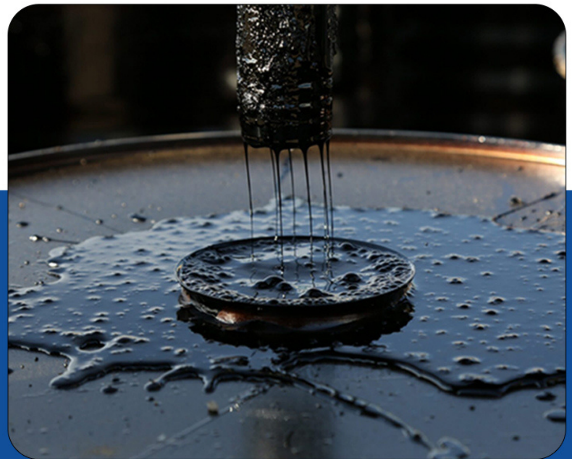
Bitumen VG - 30