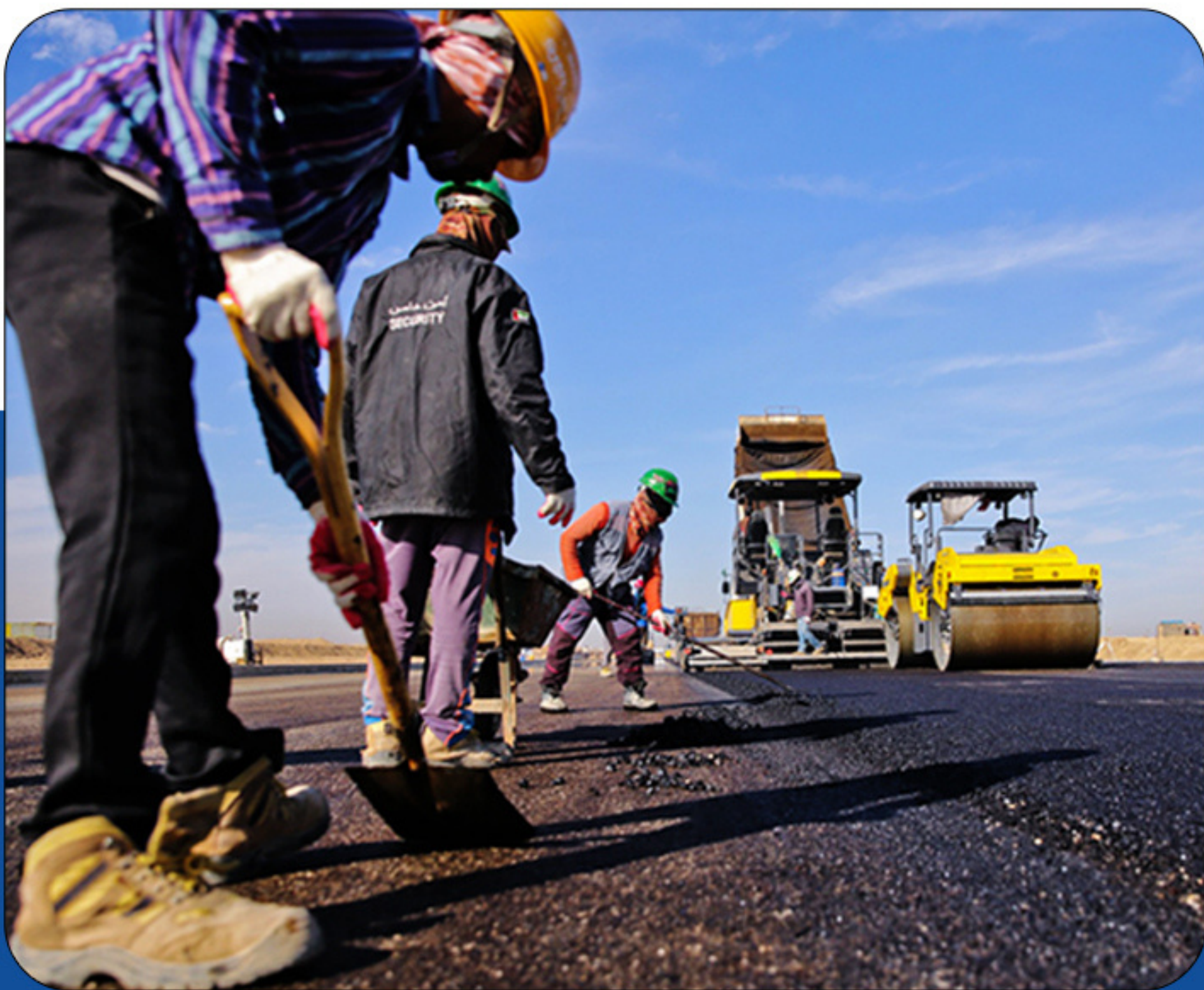
Bitumen VG - 40

We Offer Premium Quality Bitumen, At Competitive Market Price.