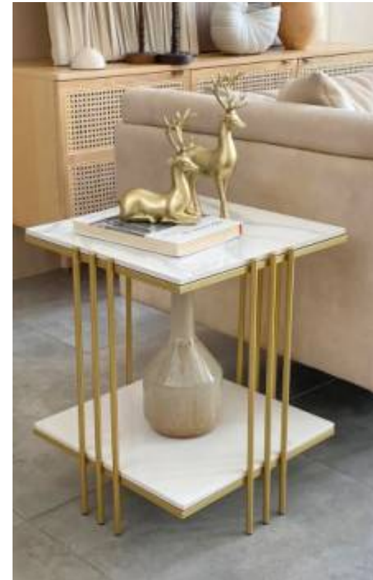
Coffee Table with Marble Tops