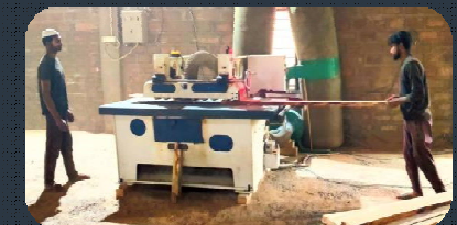
Advanced Manufacturing Process