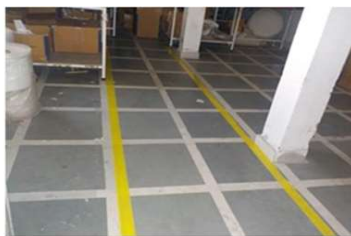
Improved 24-02-2023: Aisles remarked in the warehouse