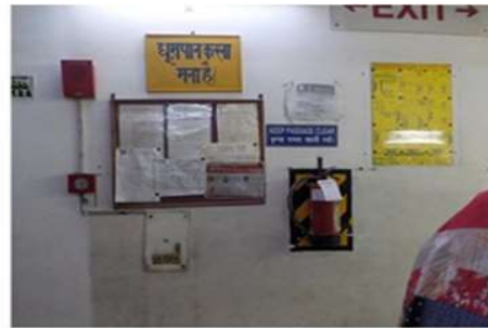
Fire Alarm and Fire Extinguisher