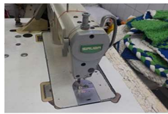
Improved 24-02-2023: Needles removed from the not in use machine