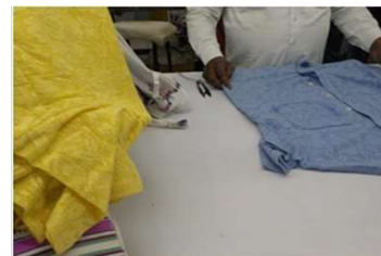
Improved 24-02-2023: Trimmers tied to the work station