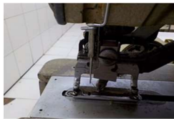
Needle not removed from unused machine