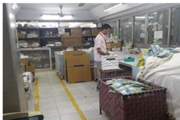
Improved 24-02-2023: Aisles free from any obstruction in the packing section