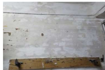
Seepage in the basement