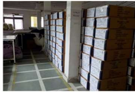
Finished Goods Area