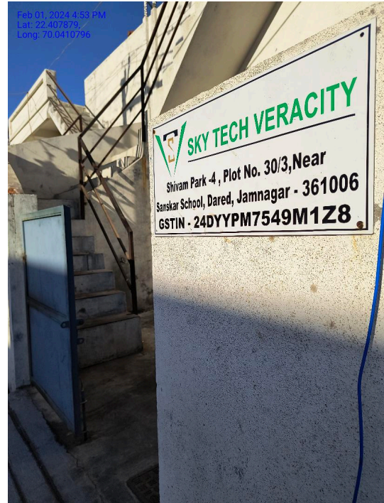
Site Exterior Picture