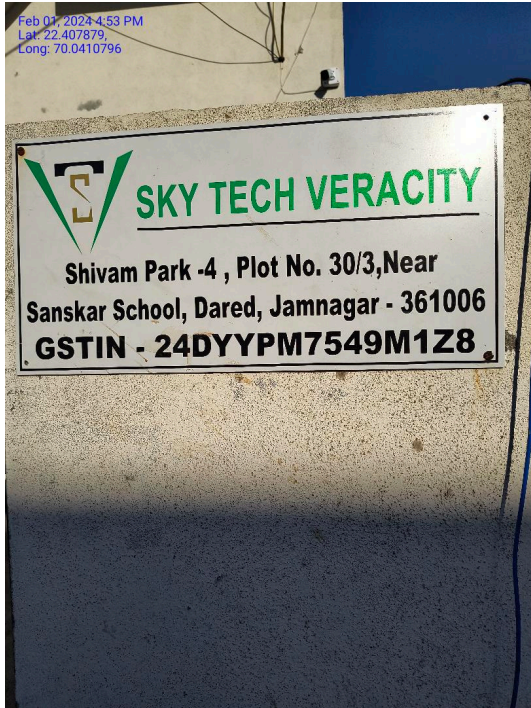
Site Exterior Picture