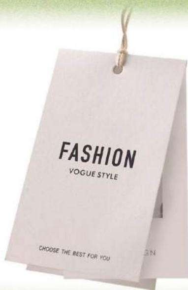
Hang Tags – Folded