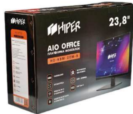
electronic product box