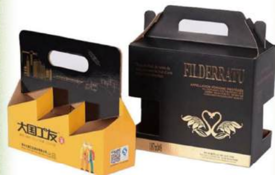
corrugated wine box

Corrugated boxes can be recycled and reused, reducing resource waste and meeting the requirements of sustainable development. also have the advantages of being lightweight, easy to process, and good in printing adaptability.