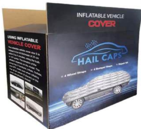
Correspondence color box