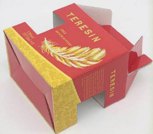
Special shaped corrugated box

Corrugated boxes have high mechanical strength, can effectively protect the contents inside, and are not easily damaged during transportation and storage. It has good wear resistance, impact resistance and extrusion resistance, and has a long service life.