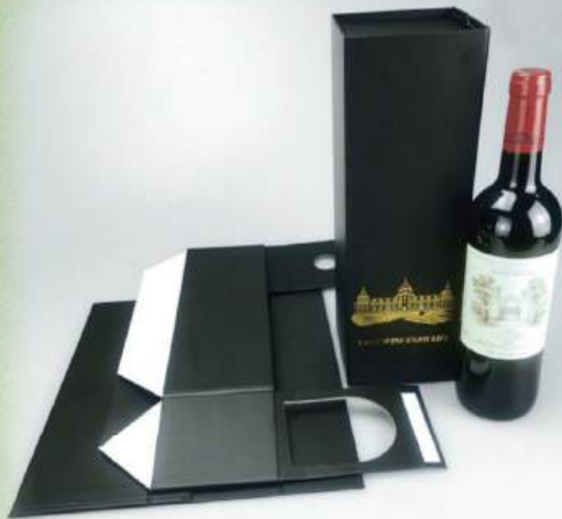
Folding wine box