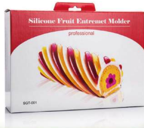
Corrugated color box