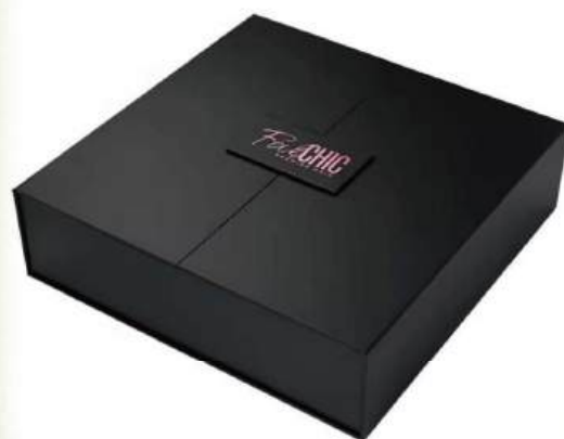
double door box

It can be customized and suitable for packaging a variety of items, such as gifts, handicrafts, cosmetics, health products, etc. Helps enhance the value and appeal of the product.