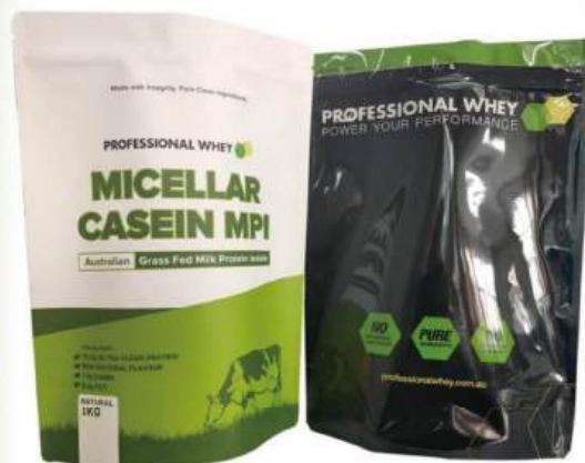
Stand up pouch

Recyclable materials are in high demand and have been widely used in many packaging formats and industries. Consumers are now demanding recyclable bags instead of plastic bags. It reduces waste on the planet.