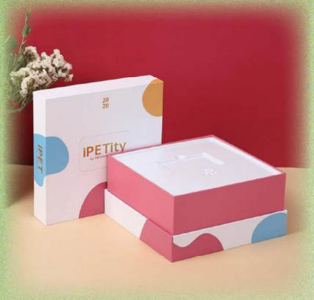
Cover of heaven and earth