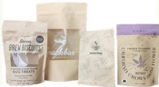
Compostable self-supporting bags