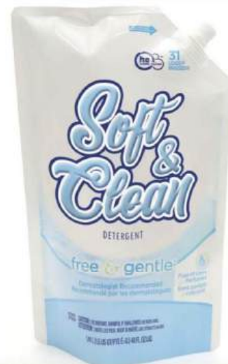
Spray pocket – nozzle bag

focuses on recycling polyethylene barrier bags into new high-quality polyethylene bags suitable for repeated recycling to help promote a circular economy. After 4 years of hard work, now we can produce polyethylene laminated bags that are recyclable after use.