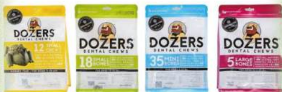
Flat bottom corner brace bag