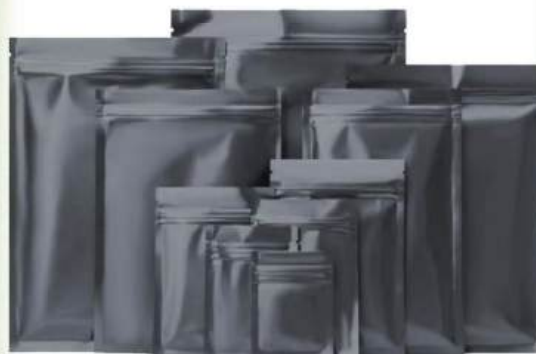
Three sided sealing bag