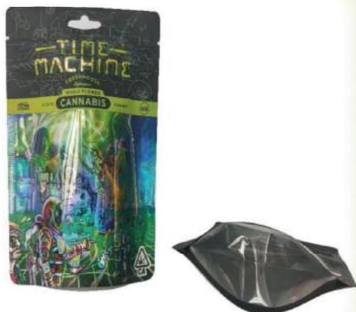
Holographic color bag