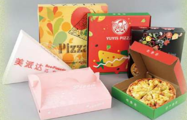
pizza food box