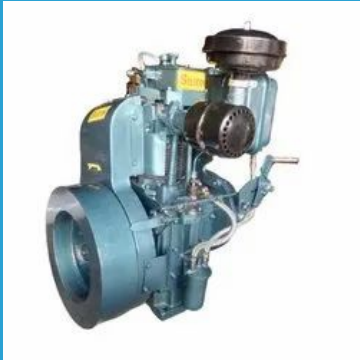
8 HP Air Cold Diesel Engine