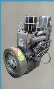
15 to 35 HP WATER COLD DIESEL ENGINE