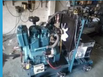
20 kVA Single Phase Air Cooled Diesel Generator