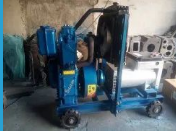
Kirloskar Diesel Generator