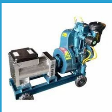
7.5 kVA Three Phase Air Cooled Diesel Generator