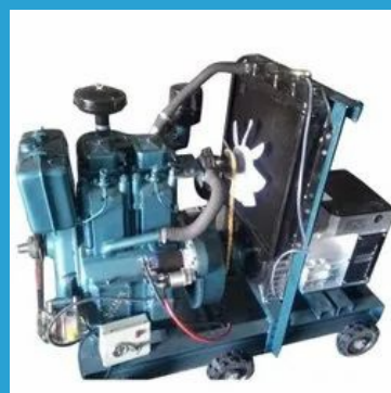
20 kVA Three Phase Water Cooled Radiator Type Generator