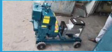
Diesel Welding Generators