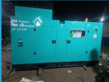
15 Kva 250 Kva Cummins Generator Set