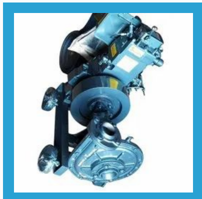
10 HP Water Cold Diesel Engine Pump Set