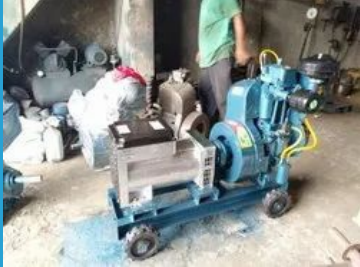
Commercial Diesel Generator Set