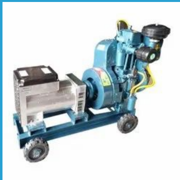
5 kVA three Phase Air Cooled Diesel Generator Set