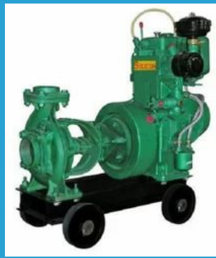
5 HP Water Cold Diesel Engine Pump Set