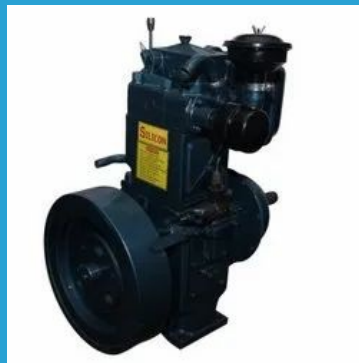
8 HP Water Cold Diesel Engine