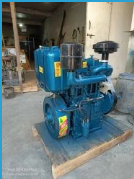
Blower type Air cooler Diesel engine