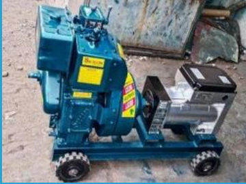
Air Cooled Diesel Genset