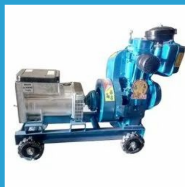
10 kVA Single Phase Air Cooled Diesel Generator Set