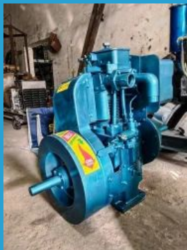
10 HP Air Cold Diesel Engine For Construction Lift