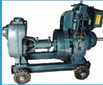
7 HP Diesel Engine With 3" x 3" Mud Pump