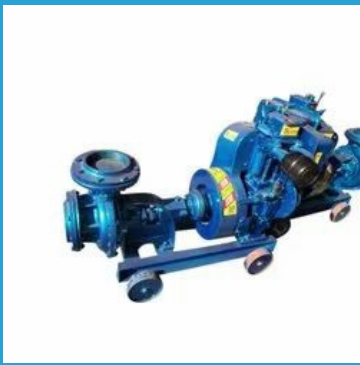
Silicon Diesel 12 HP 6" X 6" Jinga Farm Pump