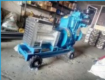
7.5 Kva Diesel Gen Set