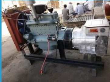
TATA 709 ENGINE WITH 30 KVA 1 PHASE AND 3 PHASE DIESEL GENERATOR SET