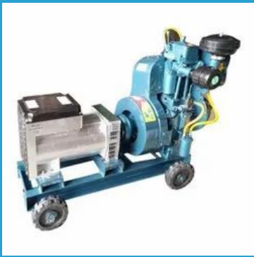
Diesel Engine Generator Set