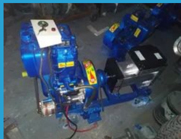
10 kva three phase water cooled with pankudi