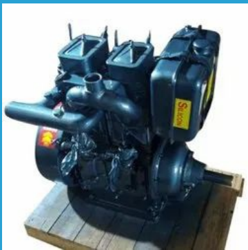
20 HP Water Cold Diesel Engine