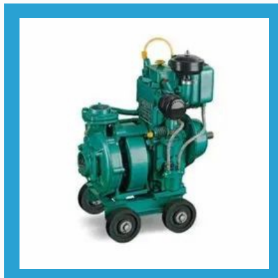
8 HP Monoblock Diesel Engine Pump Set