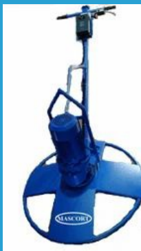
Concrete Power Floater Machine