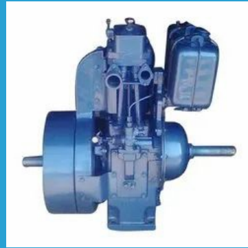
12.5 HP Air Cold Diesel Engine For Construction Hoist