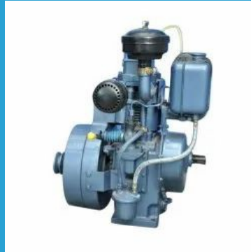
3.5 HP Air Cooled Diesel Engine