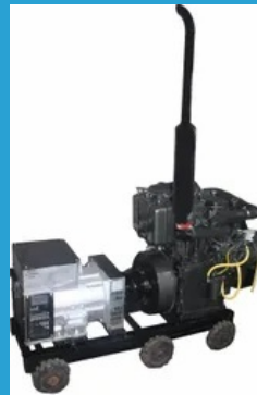
15 KVA TO 30 KVA DIESEL SILENT AND OPEN GENERATOR SET