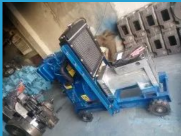
Water Cooled Diesel Engines