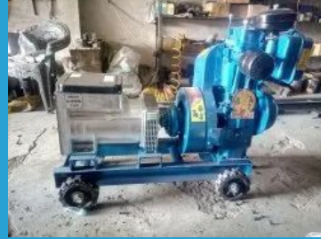
Kirloskar Dg Set