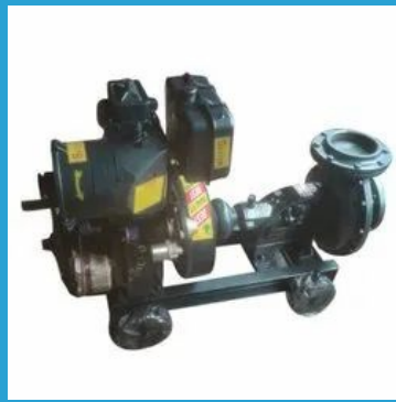
12 HP Self Start Jinga Pump