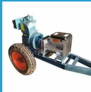
Diesel Engine Generator