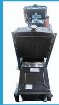
20 kva water cooled radiator type with self without battery