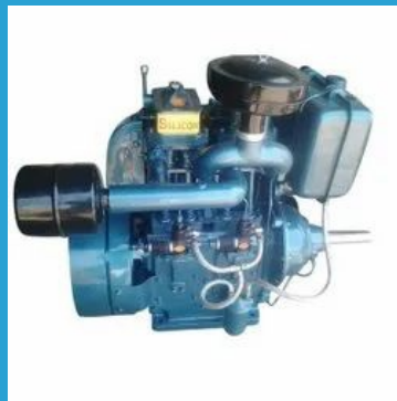
20 HP Air Cooled Diesel Engine