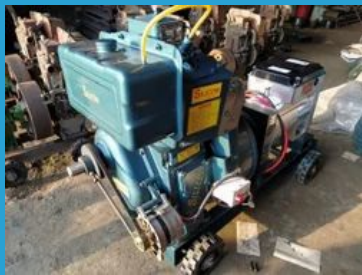
Silent Diesel Genset