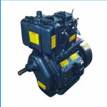
15 HP Water Cold Diesel Engine