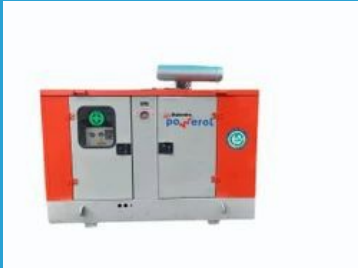
Kirloskar Diesel Generator