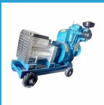
7.5 kVA Single Phase Air Cooled Diesel Generator Set