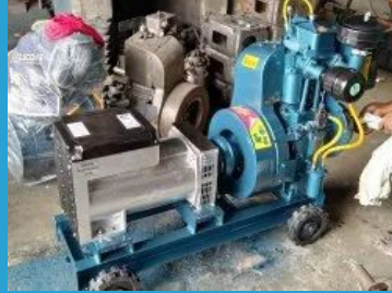
Single Phase Diesel Generator Set