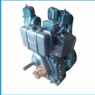
7.5 HP Air Cold Diesel Engine With Hydraulic Pump