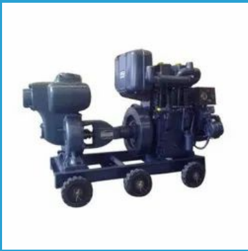
20 HP Diesel Engine With 4" X 4" Mud Pump