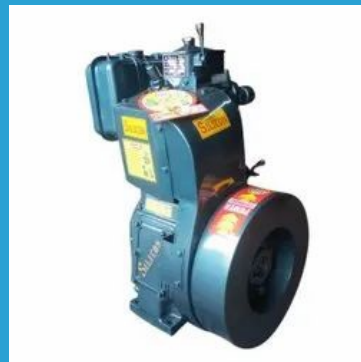
8 HP Air Cold Concrete Mixture Diesel Engine