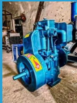
Miler Diesel engine