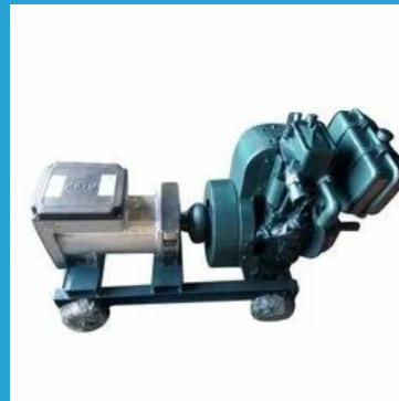
3.5 kVA Single Phase Air Cooled Diesel Generator Set