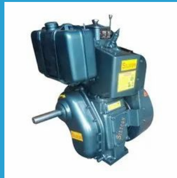
10 HP Air Cold Diesel Engine