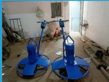
Trimix Flooring Machine