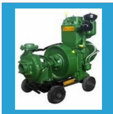
6.5 HP Water Cold Diesel Engine Pump Set