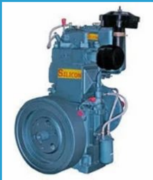
10 HP Water Cold Diesel Engine