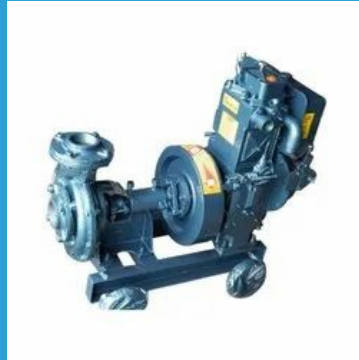
Water Pump Set