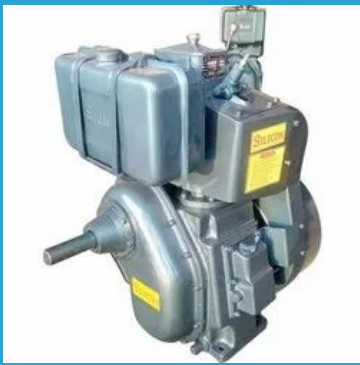
6.5 HP Haft Speed Drive Air Cold Diesel Engine