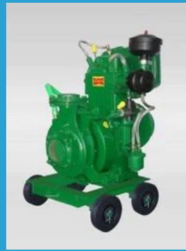
Diesel Pump Set