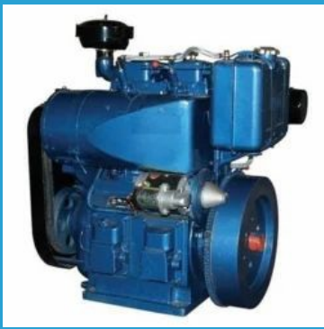
Blower type Air cold Diesel engine