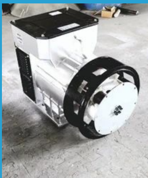
15 to 100 kva altinator