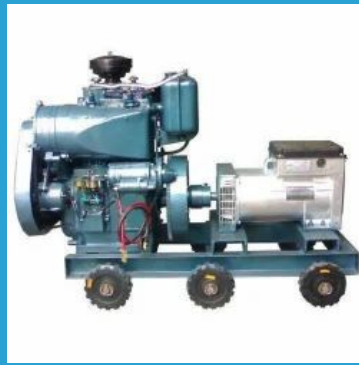
Self Start Generator Set