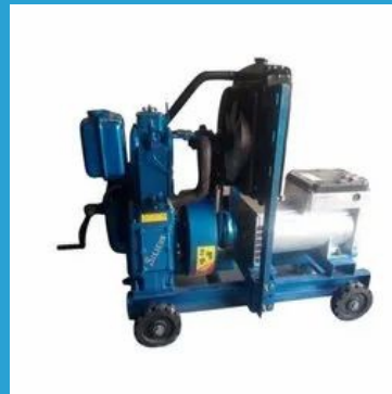
10 kVA Single Phase Water Cooled Radiator Type Generator