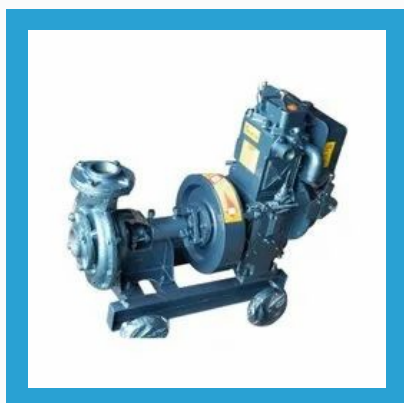
8 HP Water Cold Diesel Engine Pump Set