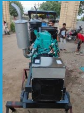
TATA 407 ENGINE WITH 25 KVA 1 PHASE AND 3 PHASE GENERATOR SET