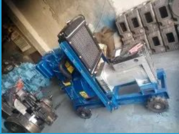
Industrial Diesel Generating Set