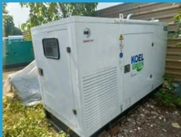
15 kva to 150 kva silent and open generator kielosker set