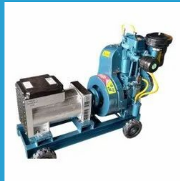
12.5 kVA three Phase Air Cooled Diesel Generator Set