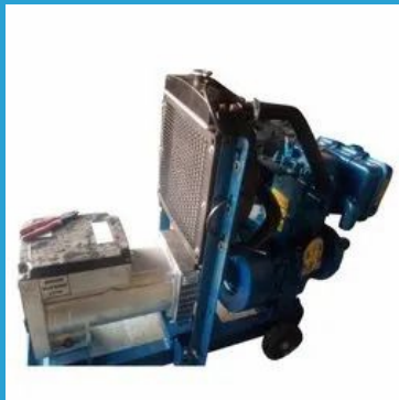
7.5kVA Three Phase Water Cooled Radiator Type Generator