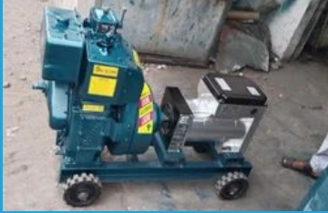
D G Sets