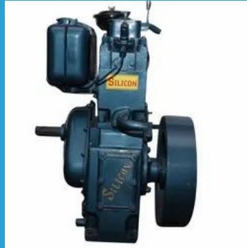
7.5 HP Water Cold Diesel Engine