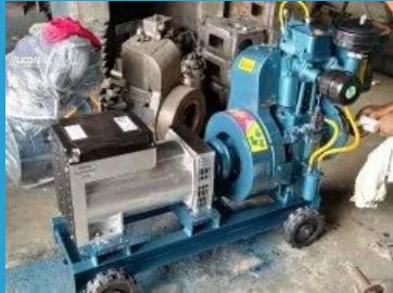
5 Kva single phase air cooled diesel generator