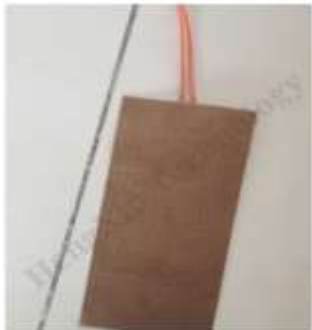
Teflon Film Heater