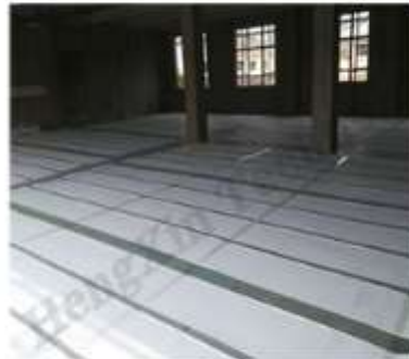
Underfloor Heating Film