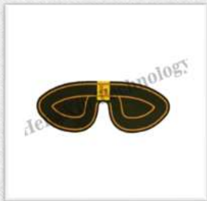
Graphene Film Heater