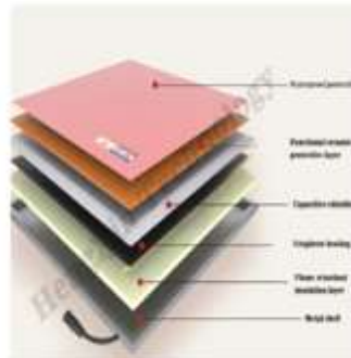
Underfloor Heating Module