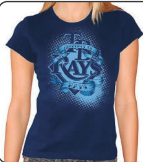
Ladies Printed T Shirt 100% Cotton