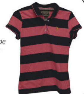
Engineering Stripe Boys Polo Shirt 100% Cotton