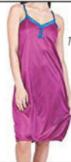
Women's Nighty 100% Polyester/ 100% Viscose