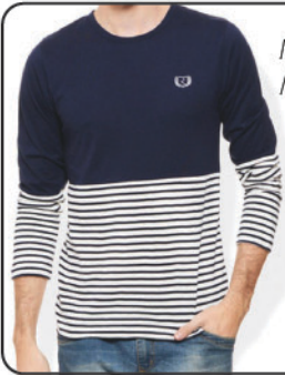
Navy/white Cotton Men's Fancy T-Shirt