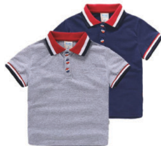
Summer Boys Short Sleeve Polo Shirts