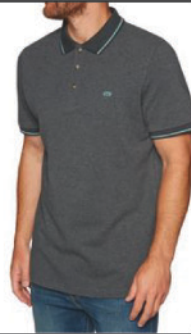
Mens Pique Polo Shirt 100% Cotton