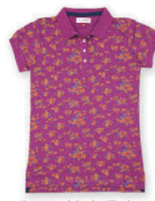
Printed Polo T-shirt