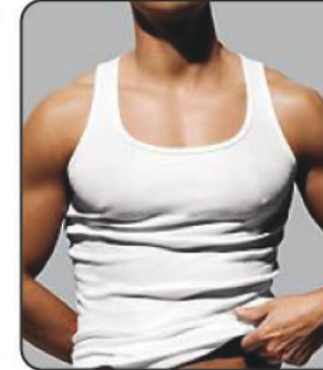
Athletic Tank 100% Cotton/ 100% Polyester