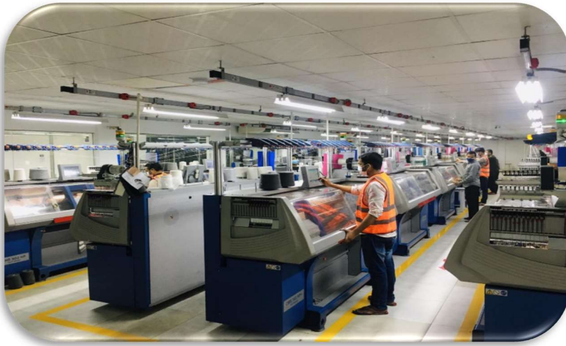
Stoll Flat Knitting Machines CMS 502 HP+ Multi Gauge E3, 5.2

“Save time on production with the highest fabric quality”-this is the principle of Stoll Multi Gauge machines. Din Sweaters offers best quality product knitted with the best machines in the industry.