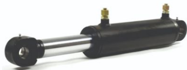
Complete Hydraulic Cylinders