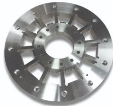
Precision Machined Components