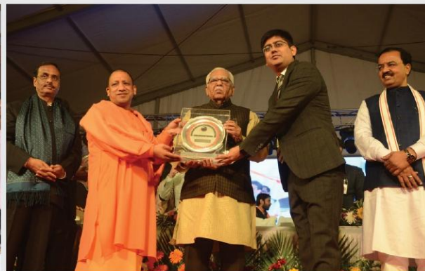
Recognition for Excellence in Exports UP Government.