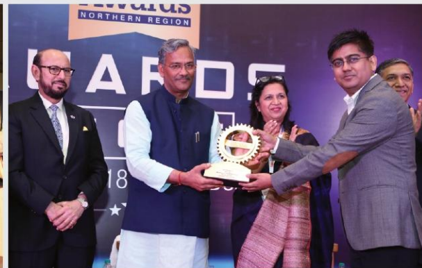
Silver Medal for Exports in the year 2015-16 in North India