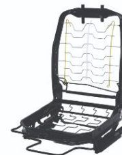
Tubular Frames & Welded Assemblies