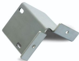
Sheet Metal Components