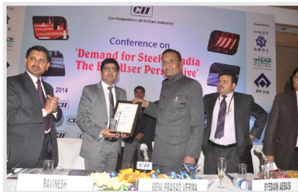
Awarded for Contribution to UP Industry