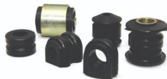
Rubber & Rubber to Metal Bonded Parts