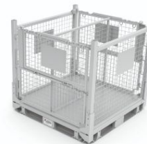
Metal Stillages & Storage Cages