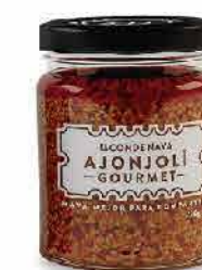
No label Look