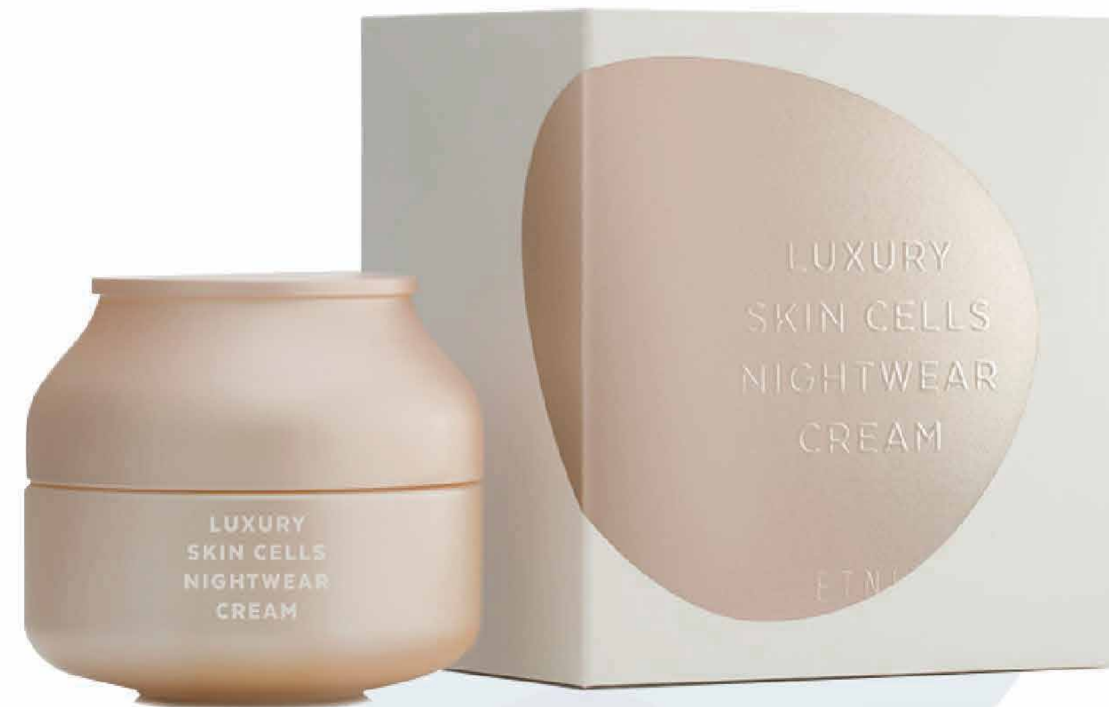
embossed folding boxes