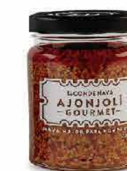
No label Look