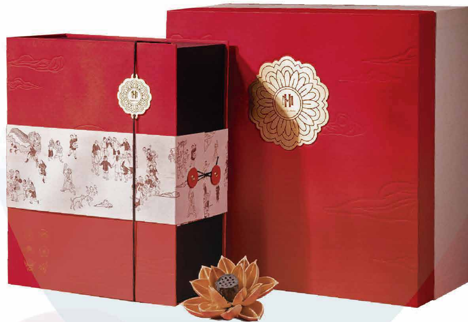
stamped folding boxes