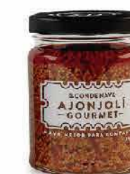
No label Look