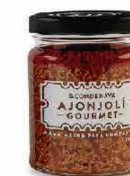
No label Look