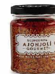
No label Look