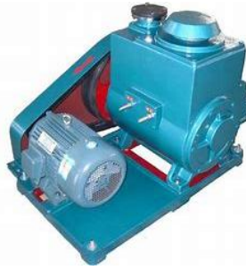
rotary vane pump