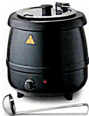
SOUP WARMER Capacity : 10 Ltr.