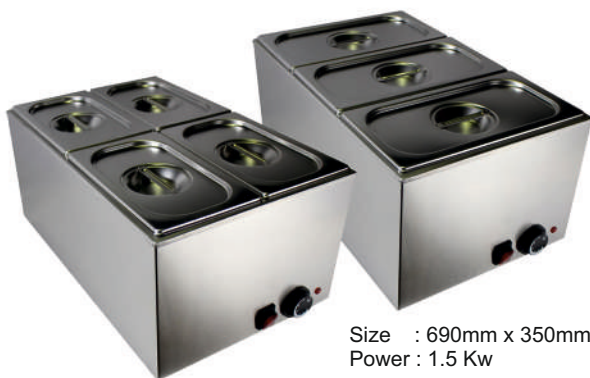
Size : 690mm x 590mm x 225mm Power : 1.5 Kw