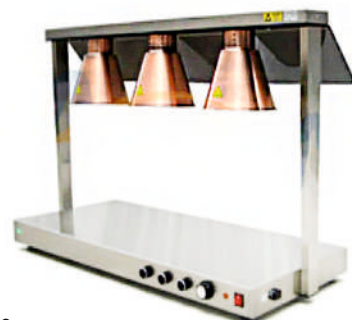
Size : 1070mm x 530mm x 700mm Power : 1400w