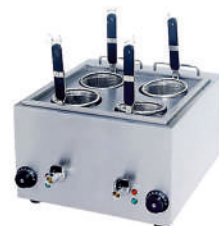
Size : 180x 180x 130mm Power : 4Kw