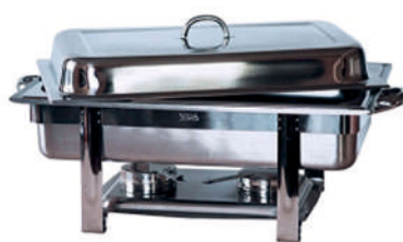
ELECTRIC CHAFER Capacity : 10 Ltr.