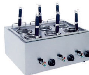
Size : 210x190x130mm Power : 6 Kw