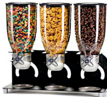
CEREAL DISPENSER TRIPLE 4 Ltr. x 3