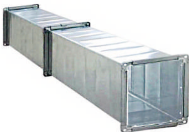
G I DUCT