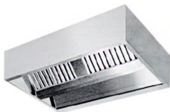
SS HOOD 1