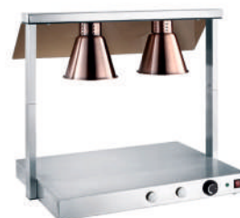
Size : 780mm x 530mm x 700mm Power : 1000w