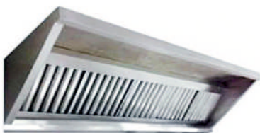
SS HOOD 1