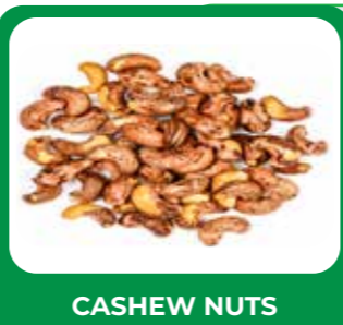
CASHEW NUTS ROASTED SALTED