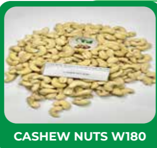
CASHEW NUTS W180