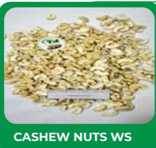
CASHEW NUTS WS