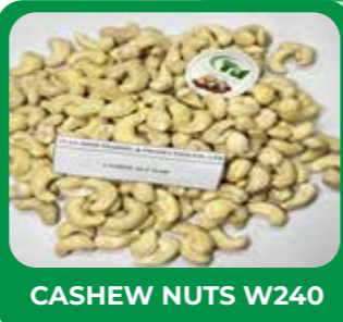
CASHEW NUTS W240