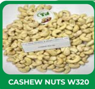
CASHEW NUTS W320