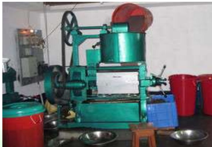
Actual Image of Oil Expeller Plant