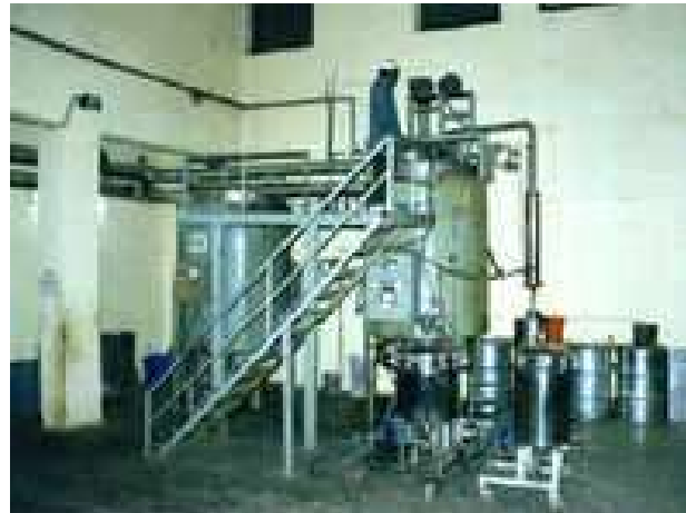
Actual Image of Oil Expeller Plant