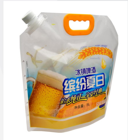
Liquid bag 液体包装袋

简介：饮料在我们的日常生活中是必不可少的。从它以前的瓶子到现在的市场，通过越来越多的塑料饮料包装袋可以发现，饮料包装袋的市场份额越来越高，也越来越受到顾客的青睐。这不仅是因为饮料包装袋的便利性，还因为它形状的可变性和印刷颜色的多样性，这使得饮料包装袋不仅实用，而且美观。一个吸嘴，具有自支撑效果，印刷生动，造型多样。这是大多数饮料包装袋的独特形状。