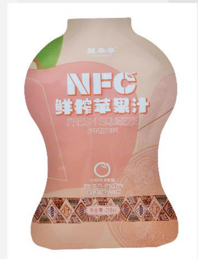
Juice pouch 果汁袋