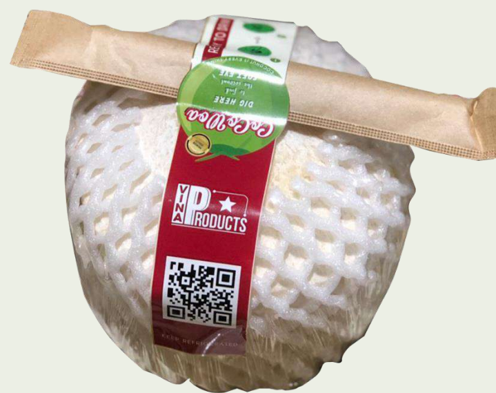
COCONUT WITH BAMBOO STRAW