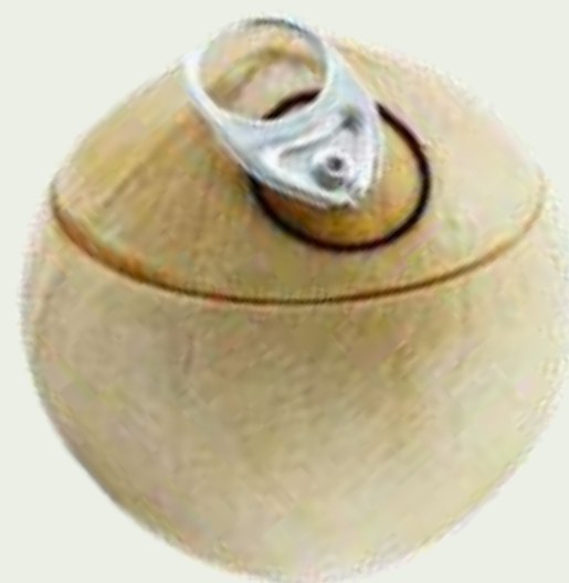
WITH LID ON