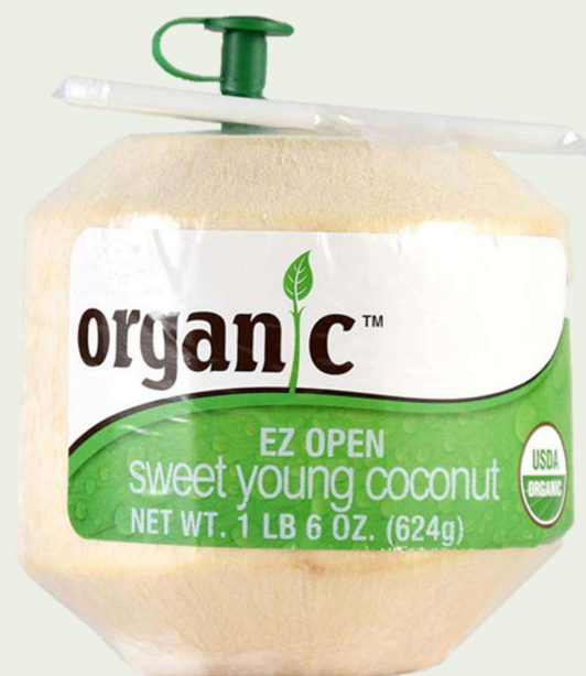
COCONUT WITH PUSH BOTTON AND STRAW