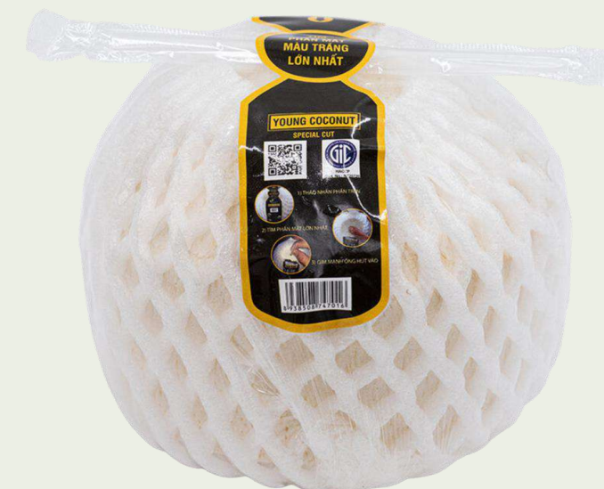
COCONUT WITH STRAW