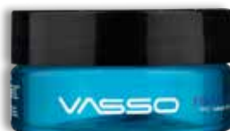
STYLING WAX PRO-AQUA BALLER