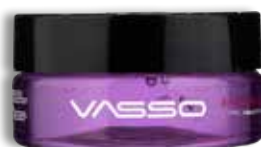
STYLING WAX PRO-AQUA HOOK UP