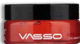
STYLING WAX PRO-AQUA RESIST