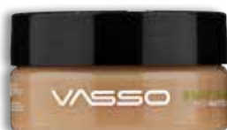
STYLING WAX PRO-MATTE MATTE HEAD