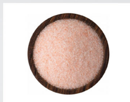
Light Pink Fine

On the basis of color and grain sizes we providing a variety of Himalayan Pink Salt products to meet global consumers' different needs for the best salt.