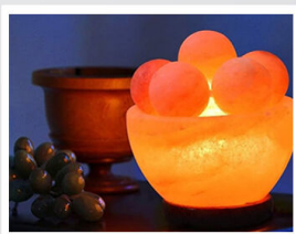
Fire Bowls Lamps