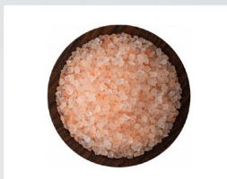
Light Pink Coarse