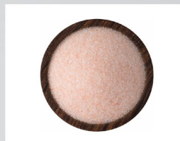
Medium Pink Fine