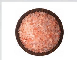
Medium Pink Coarse