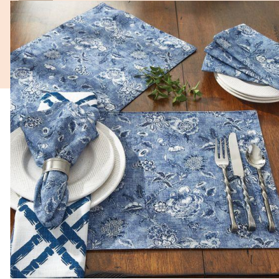
Table Cloth Table Runner Place Mat Napkin