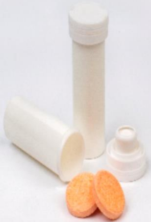
Tube 67 mm with Desiccant Closure

Plastic bottles with Plastic tubes with snap-on closures with integrated desiccant easy open caps