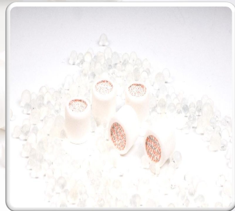
Desiccant capsule 0.3 gm