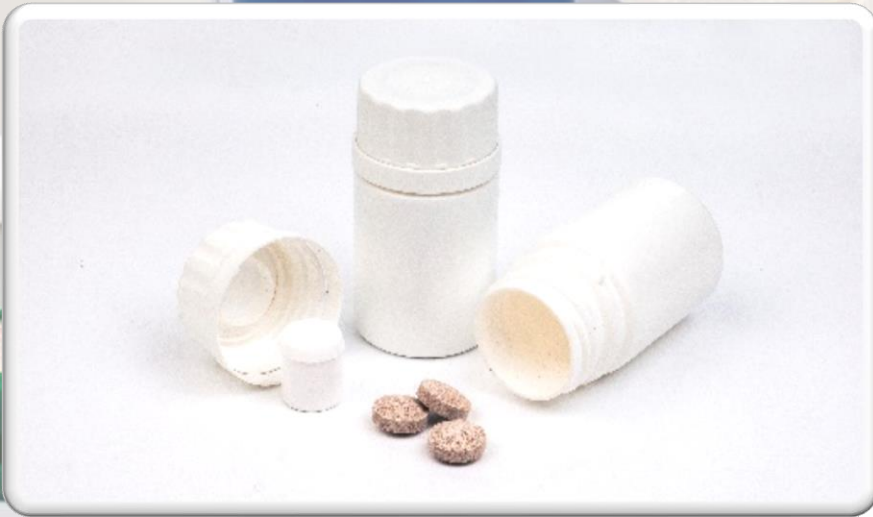
Jar with tamper evident cap 75 ml

Plastic bottles with screw caps and snap-on caps as primary pharmaceutical packaging with integrated desiccant