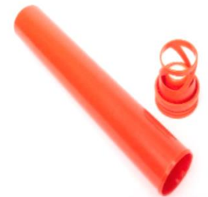
Tube 138 mm with Desiccant Closure