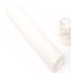
Tube 143 mm with Desiccant Closure