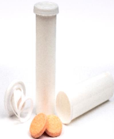
Tube 98 mm with Desiccant Closure