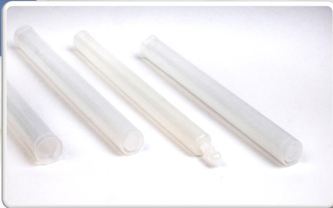
VAGINAL CREAM APPLICATOR

Our applicators are favored by many customers for use in clinical trials where proper dose administration and efficacy are critical. Our newest applicator, the Comfort Tip, features a silky smooth tip designed with the user in mind.