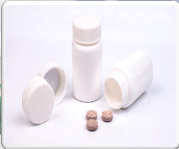
Jar 100 ml with shield safe cap

Plastic bottles with screw caps and snap-on caps as primary pharmaceutical packaging with integrated desiccant