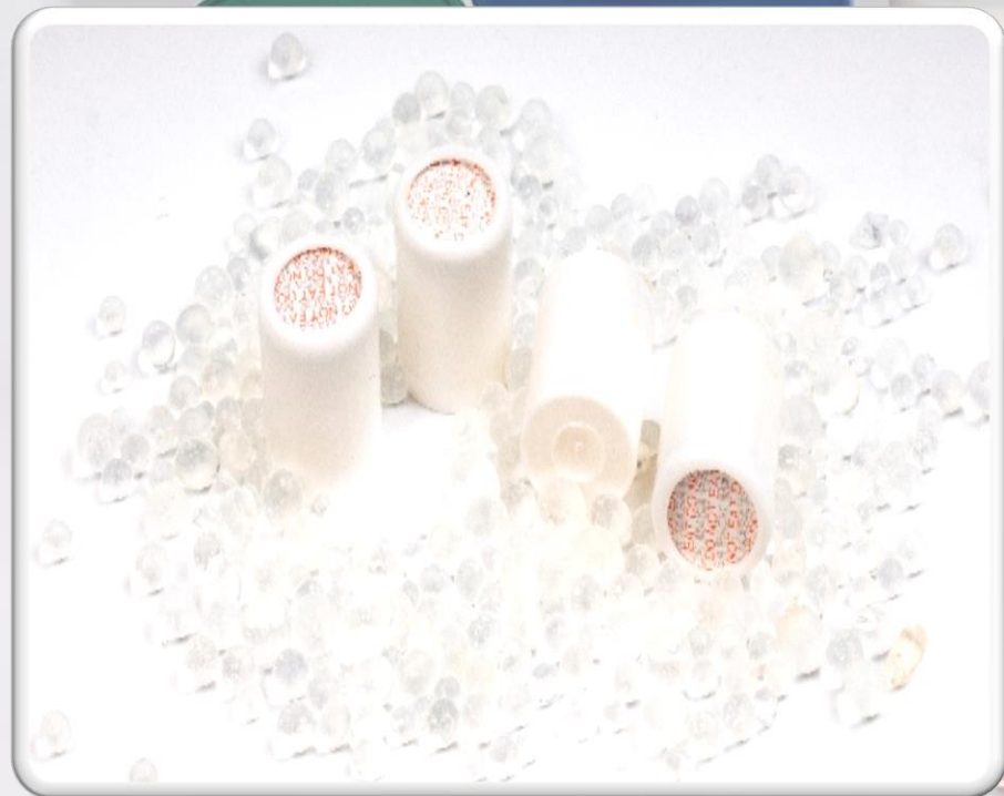
Desiccant capsule 1 gm

Desiccant capsules in pharmaceutical primary packaging .