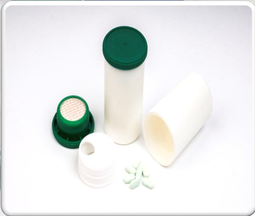
Tube with Gorge pills & Desiccant Closure

Plastic tubes with snap-on closures with integrated desiccant