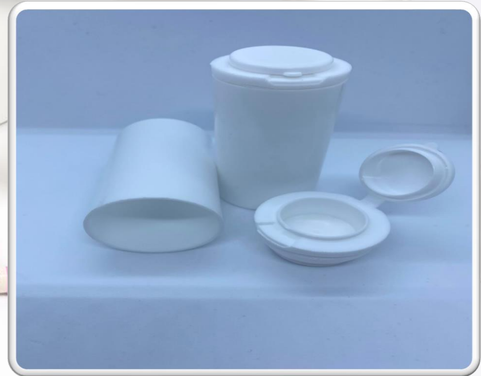
Tube 47 mm with Desiccant Closure have an Tablet store