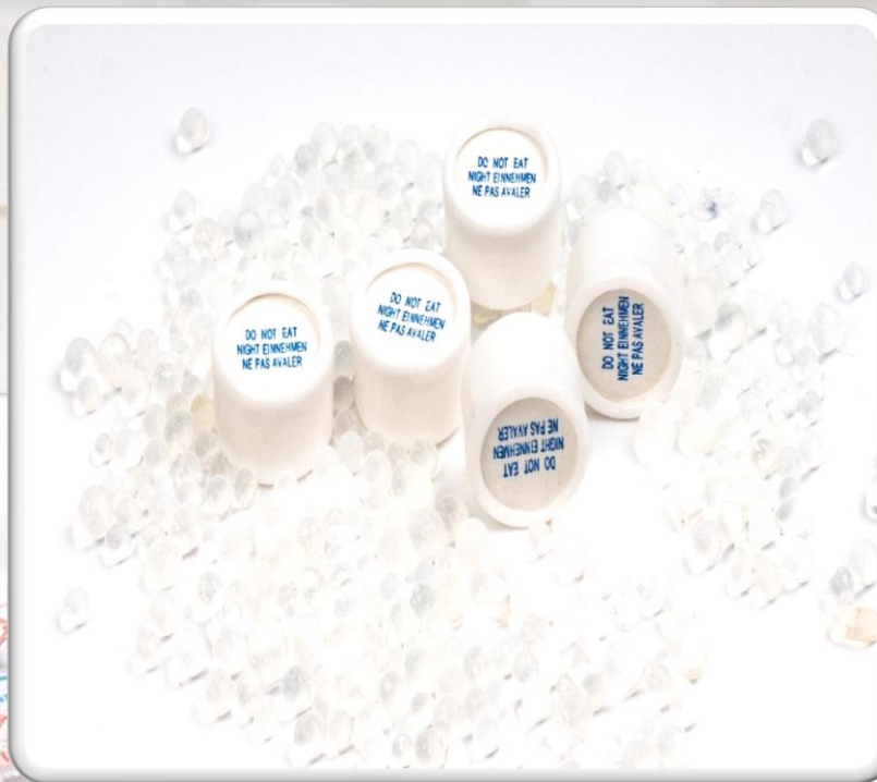
Desiccant capsule 0.7 gm