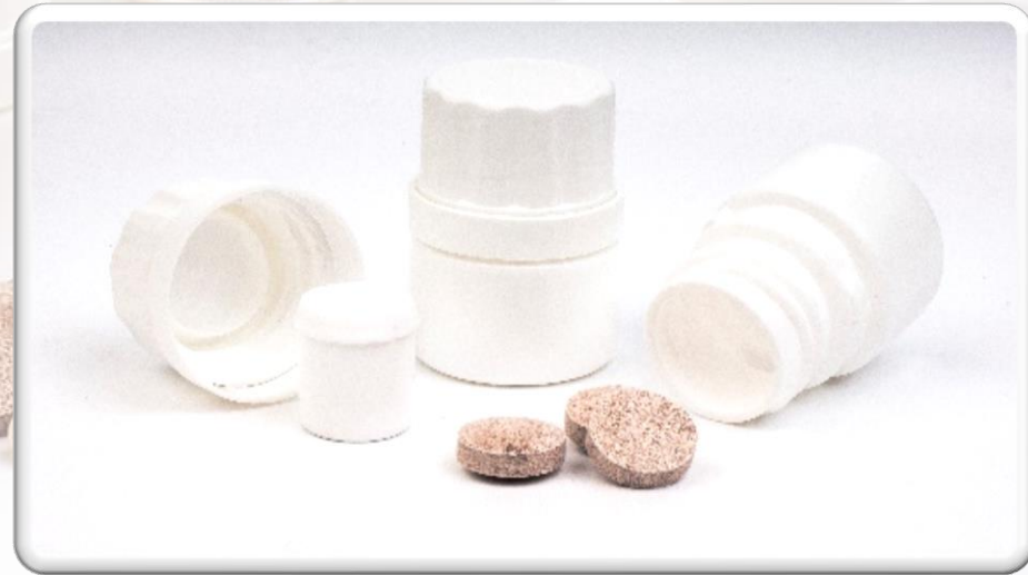
Jar with tamper evident cap 35 ml