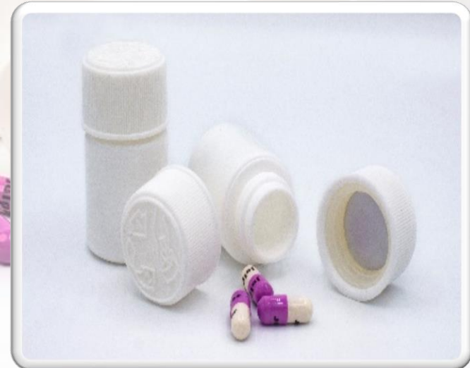
Jar 15 ml with shield safe cap