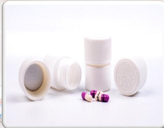
Jar 20 ml with shield safe cap